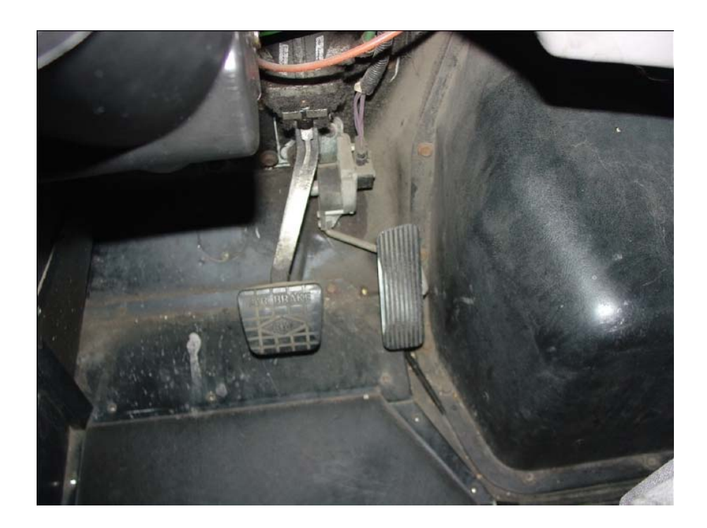
Figure 7. Pedal configuration of Nanuet driver's usual bus, showing accelerator set farther back than brake pedal and accelerator mounting below accelerator pedal.

Figure 6. Pedal configuration of Nanuet accident bus (Bluebird), with accelerator and brake pedals on same plane.