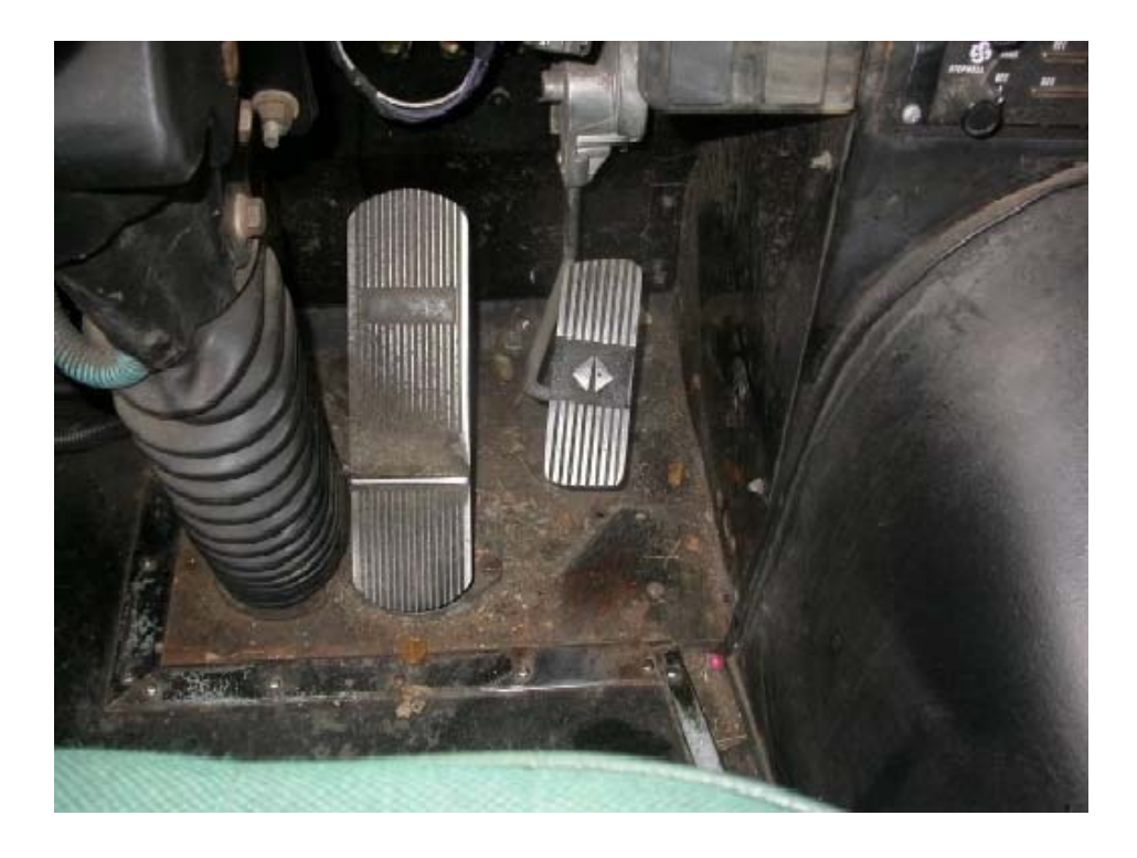
Figure 4. Pedal configuration of Falls Township driver's usual bus.

The Falls Township accident occurred while the driver was performing his typical daily route—but using a bus that was significantly different from the one to which he was normally assigned. The driver's usual bus incorporated a bulkhead-mounted accelerator pedal (see figure 4) that operated along a different arc of travel than the floor-mounted accelerator found on the accident bus. Moreover, each bus was equipped with a floor-mounted brake pedal that functioned along an arc of travel that was comparable to the accelerator on the accident bus. (See figure 5.)