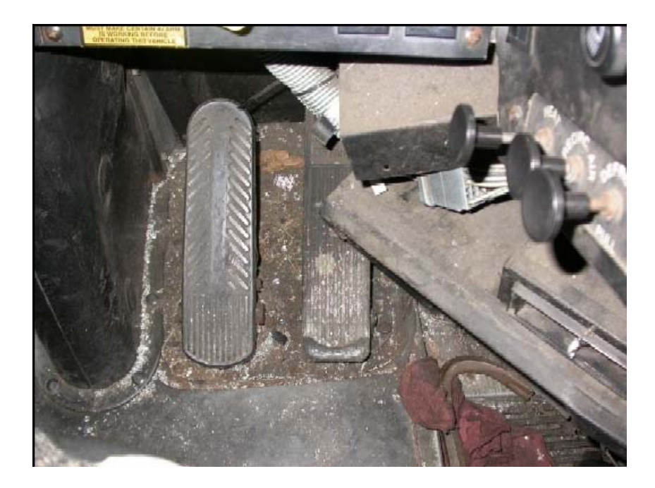
Figure 3. Accident damage in foot well of Falls Township school bus.

It is also noteworthy that the accident bus was not the driver's usual front-engine bus. The replacement bus had a rear-engine configuration and was equipped with pedals of different sizes, heights, and separation than his usual bus. As described above, unfamiliarity with a vehicle has been linked to a higher frequency of pedal misapplication and unintended acceleration. The difference in engine location led the driver to misidentify the revving engine he heard as belonging to another bus instead of the one he was driving. The NTSB concludes that the Falls Township driver's unfamiliarity with the school bus contributed to the occurrence of pedal misapplication.