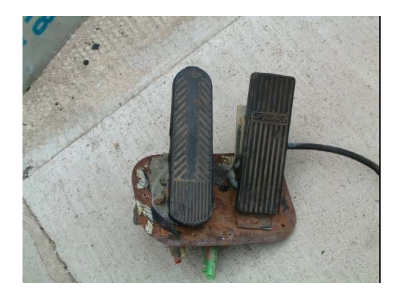
Figure 8. Pedal configuration of Liberty accident bus.

Although the Liberty accident vehicle was the driver's usual bus, the accelerator pedal and the brake pedal were nearly identical. Figure 8 shows the pedal layout for the Liberty accident bus. In addition to having similar size, the two pedals had the same arc of travel and were both mounted to the vehicle at the bottom of the pedal.