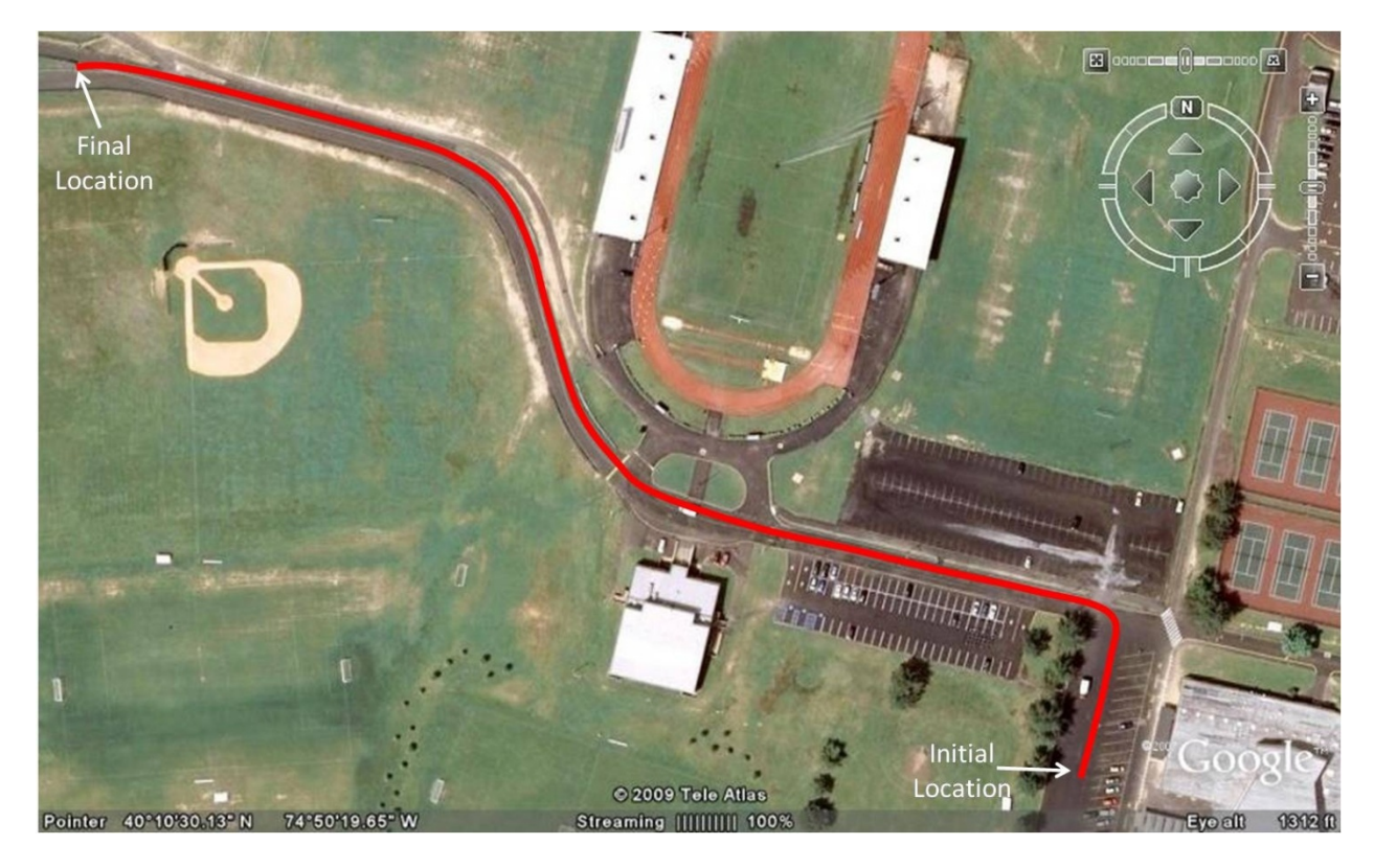
Figure 2. Falls Township, Pennsylvania, accident location and vehicle path.