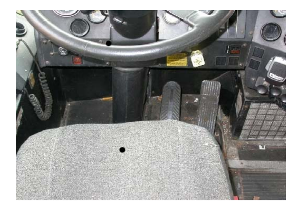
Figure 5. Pedal configuration of exemplar Falls Township accident bus.

In 1994, another driver was involved in a collision while operating the Falls Township accident bus, only weeks after it had been placed in service. An investigation by the school district, with input from Thomas Built, concluded that this earlier accident was the result of pedal misapplication. Of particular interest, both drivers of the accident bus (in 2007 and in 1994) had previously operated buses manufactured by International Corporation. Accordingly, it appears that drivers transitioning from one bus to another—especially from a bus with a different pedal configuration—may be more prone to pedal application error.