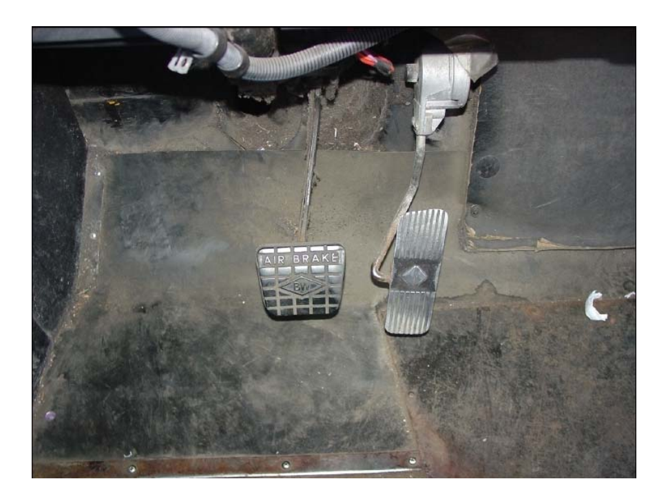
Figure 6. Pedal configuration of Nanuet accident bus (Bluebird), with accelerator and brake pedals on same plane.