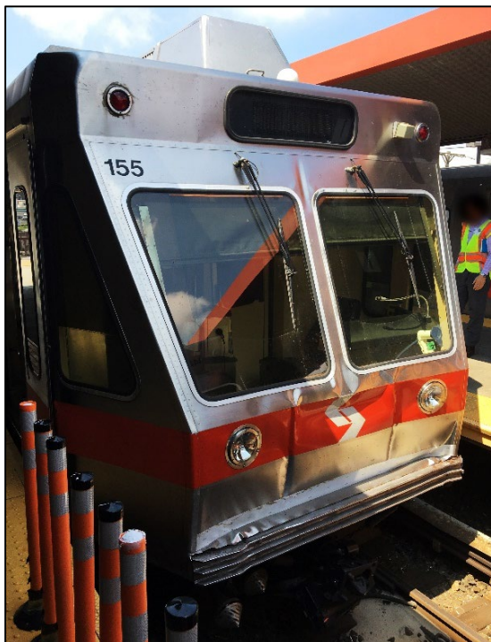
Figure 3. Postaccident collision damage to car 155.

Car 155 sustained exterior damage on the striking end of the coupler and front bulkhead panel and adjacent sidewall structure. 4 (See figure 3.) On car 148's exterior, the struck end coupler, front bulkhead, and adjacent sidewall structure were damaged. The collision damage on both cars did not extend into the interior occupant space; only localized minor frame buckling was found. In addition, minor floor panel buckling, a broken door panel window, wall and ceiling panel cracks, dislodged seat cushions, and a misaligned door panel were noted on each car.