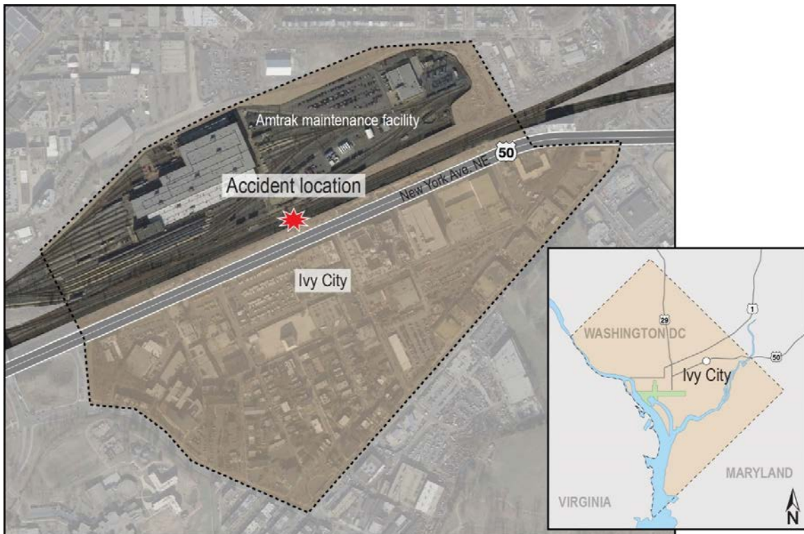
Figure 1. Map of accident site in Washington, DC.

On June 27, 2017, at 11:18 p.m. eastern daylight time, two CSX Transportation (CSX) employees (conductor and conductor trainee) were struck and killed by southbound Amtrak (National Railroad Passenger Corporation) train P175 at Amtrak milepost (MP) 134.5 in Ivy City, a small neighborhood in Northeast Washington, DC. 1 The two employees were on the track walking toward the front of their southbound train after inspecting a railcar with elevated temperature reported by a track-side detector. Their backs were to the approaching southbound Amtrak train when they were struck. At the time of the accident, the sky was clear; visibility was 10 miles, and the temperature was 64°F. Additional ambient lighting was provided by a nearby Amtrak maintenance yard. (See figure 1.)