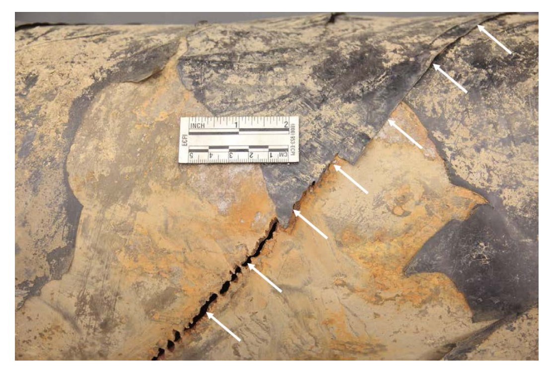
Figure 4. Photograph of ammonia pipeline crack showing alignment with seam in protective tape and sawtooth crack features.

The residual curvature of the pipe section after removal from the pipeline indicted that the stress from the bending loads had exceeded the yield stress of the steel. The tensile stress from bending would have been the greatest on the bottom of the pipe, at the external surface, in the area where cracking initiated. The hoop stress from the MOP at the rupture location is about 70 percent of the specified yield stress of the steel.