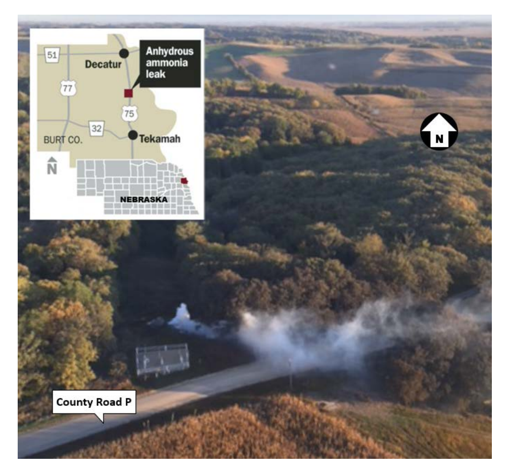
Figure 1. Aerial photograph of active anhydrous ammonia release with map insert showing release location.