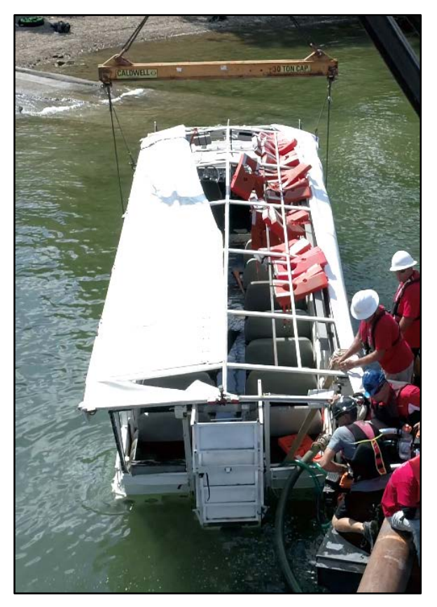
Figure 5. Torn canopy of the Stretch Duck 7 found during recovery operations.

The entire passenger and crew space of the Stretch Duck 7 had been covered by a fixed canopy. Upon recovery of the vessel, the canopy was found torn from front to back (see figure 5 ). It was peeled back over the starboard side but largely remained intact on the port side. The canopy was constructed of vinyl measuring .032 inches thick and pressed into a seam along the horizontal support at the center of the vessel. Underneath the canopy, the Stretch Duck 7's personal flotation devices (PFDs, commonly called lifejackets) were stored above the seating compartment. Of the 56 lifejackets investigators counted postaccident, the majority of them—a total of 41—were still connected to the vessel's canopy framing by their straps.<sup>16</sup> With the PFDs in their storage locations above the passengers, vertical egress was blocked during the sinking, despite the canopy being peeled back over the starboard side.