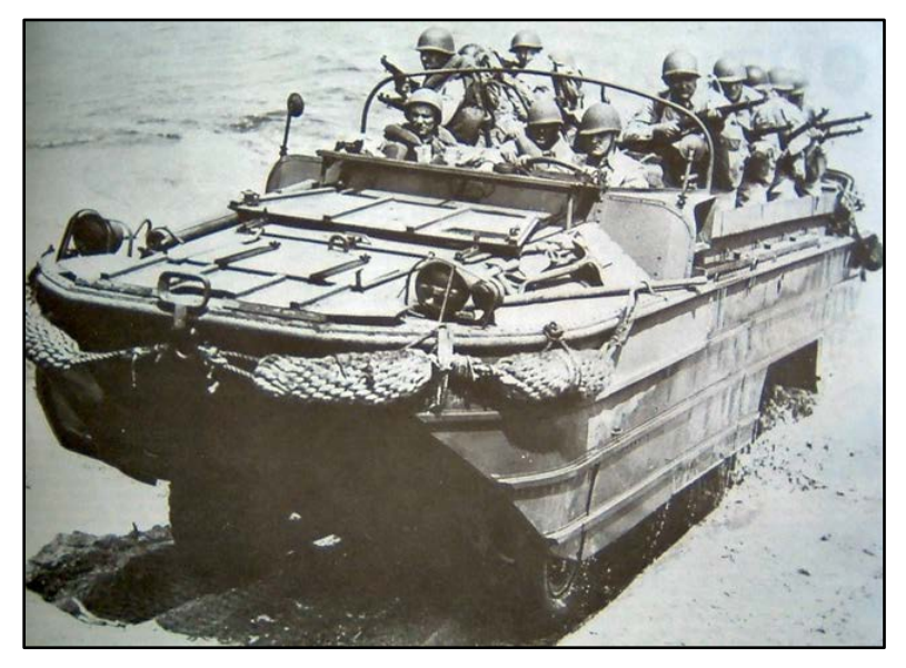
Figure 3. DUKW in military use before conversion to passenger service.

The NTSB has investigated several accidents involving commercial APVs within the United States, including the current investigation of the Stretch Duck 7. Whether the incident occurred on land or in the water, in 5 out of 6 of these investigations the vessel involved shared similar dimensions and/or characteristics with the World War II-era DUKW amphibious vessel (see figure 3 ).<sup>6</sup> In total, 37 deaths and 104 injuries resulted from these six DUKW-related accidents.