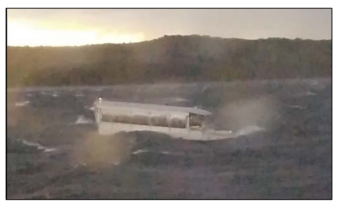
Figure 4. Stretch Duck 7 moments before sinking.

During the waterborne portion of its final voyage, the Stretch Duck 7 was exposed to high winds and waves estimated at 3 to 5 feet. The video recorder on board captured bilge alarms sounding 4 minutes after the vessel encountered severe weather, signaling an ingress of water. About 4 minutes later, the Stretch Duck 7 sank. Witness videos showed the vessel pitching in the storm with white-capped waves covering the bow several times (see figure 4 ). In the forward section of the vessel, the ventilation openings that supplied combustion and cooling air to and from the engine most likely permitted water to enter the engine compartment, from where it would have flowed freely throughout the rest of the hull. The additional water weight would have further lowered the vessel's freeboard and thereby subjected it to more rapid flooding.