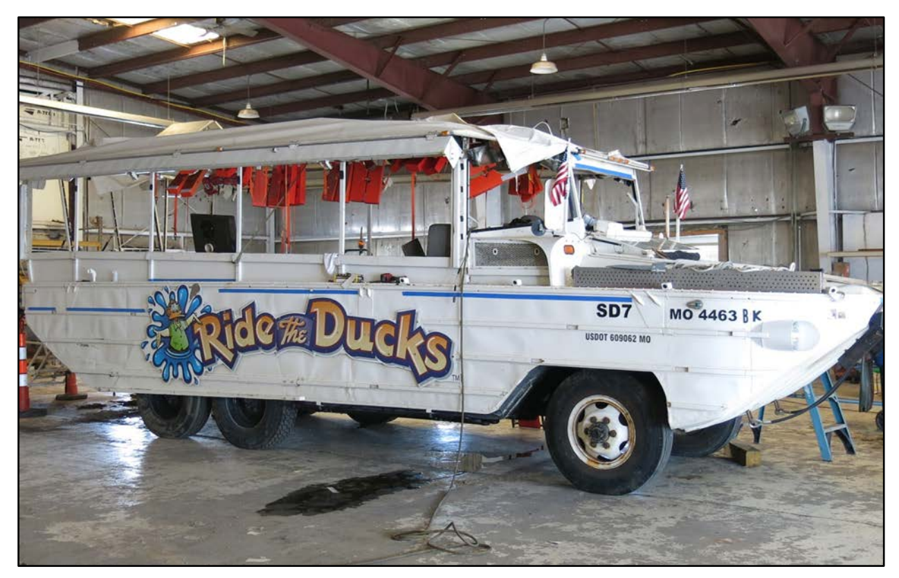
Figure 1. Stretch Duck 7 after salvage from Table Rock Lake, July 2018.

On the evening of July 19, 2018, seventeen of the thirty-one persons aboard the Stretch Duck 7 died when the amphibious passenger vessel (APV) sank during a high-wind storm that developed rapidly on Table Rock Lake near Branson, Missouri. The National Transportation Safety Board (NTSB) is investigating the sinking of the Stretch Duck 7, which originally was built in 1944 as a DUKW landing craft to carry military personnel and cargo during World War II and was then modified for commercial purposes to carry passengers on excursion tours (see figure 1 ).<sup>1</sup>