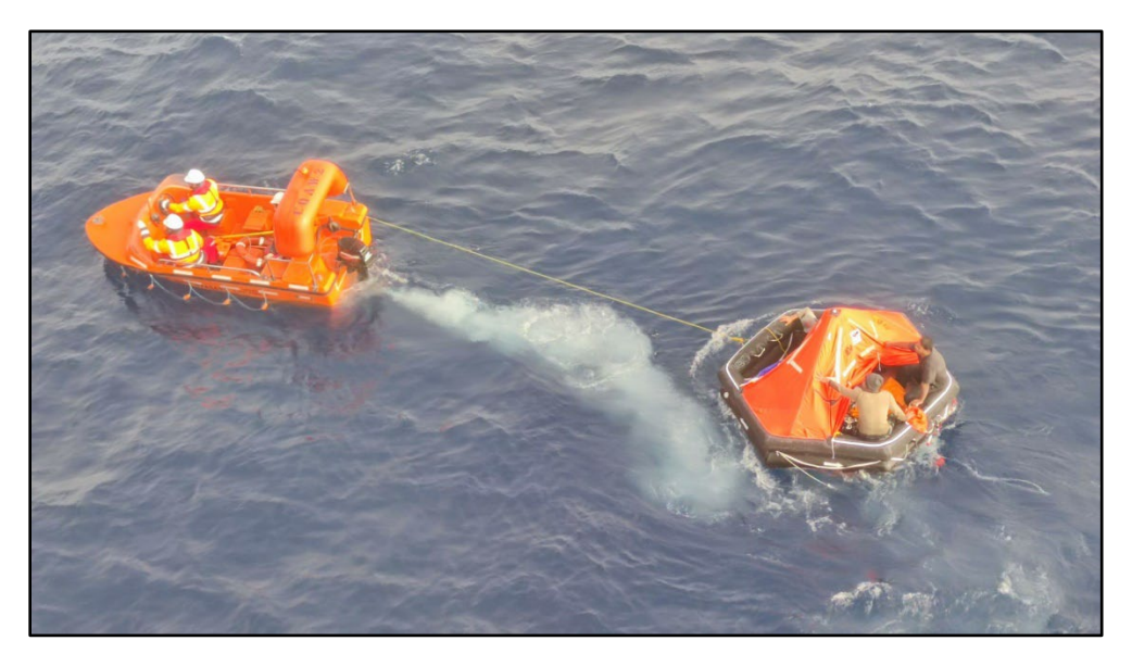
Figure 5. NordRubicon rescue boat with Blue Dragon liferaft in tow.

The second C-27J arrived at 0850 and was on scene when the NordRubicon arrived about 0900. The crew of the NordRubicon deployed the vessel's rescue boat. The Blue Dragon crew left the vessel's EPIRB on board the fishing vessel before again abandoning the vessel to the liferaft to facilitate their transfer to the NordRubicon . The NordRubicon crew secured a tow line to the Blue Dragon liferaft and towed the fishing vessel crew back to the bulker, where they were recovered by 1135. Once the Blue Dragon 's crew was safely on board the NordRubicon , the bulk carrier proceeded to Sacramento, California. The Blue Dragon remained drifting until November 12, when the Blue Dragon II , a similar vessel owned by the same company, towed the hulk (burned vessel) to San Pedro, California.