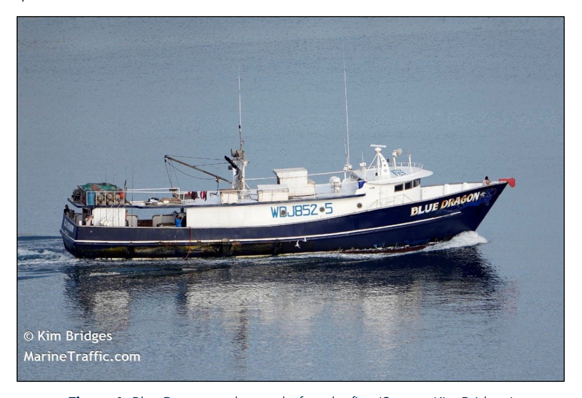
Figure 1. Blue Dragon under way before the fire.

On November 10, 2021, about 0015, the fishing vessel Blue Dragon was under way in the North Pacific Ocean, 350 miles offshore of Monterey, California, engaged in longline fishing operations, when the vessel caught fire. The Blue Dragon 's six crewmembers and a National Marine Fisheries Service observer attempted to fight the fire but were unsuccessful. They abandoned the Blue Dragon and were rescued by a Good Samaritan vessel. The Blue Dragon was later towed to San Pedro, California. No pollution or injuries were reported. Damage to the vessel was estimated at over $500,000.