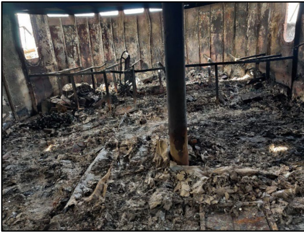
Figure 6. Blue Dragon wheelhouse exterior ( left ) and interior looking forward ( right ), after the fire. The framing of the false deck in right image indicates the location of what was the wheelhouse deck.

After the casualty, investigators visited both the Blue Dragon and Blue Dragon II . The Blue Dragon 's wooden wheelhouse console had held two laptops used for navigation and a flat screen monitor used as a television. The wheelhouse deck was raised a few feet above the main deck, and beneath this "false deck" was a void space. Investigators found paint cans and welding rods under the Blue Dragon 's false deck. According to the captain of the Blue Dragon , there was nothing stowed under the wheelhouse console, and he believed the cause of the fire was electrical. A deckhand told investigators that he was aware of computer equipment and possibly batteries stowed under the console. There was no smoke detector installed in the wheelhouse. The Blue Dragon II 's wooden wheelhouse console was similar to the Blue Dragon II 's console, investigators found wiring that did not meet typical marine standards—there were bare wires, improper connections, and loose and disorganized wiring.