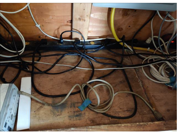
Figure 7. Blue Dragon II pilothouse console wiring.

Under the Coast Guard Authorization Act of 2010, commercial fishing vessel safety examinations are required once every 5 years for fishing vessels that operate 3 miles beyond shore. These safety examinations help ensure that all the required safety equipment and systems on board are in serviceable condition; examinations do not include the hull, electrical systems, or machinery as required for Coast Guard-inspected vessels. The Blue Dragon last underwent a commercial fishing vessel safety examination in June 2020. Deficiencies were issued for the bilge pump and lack of alcohol testing kits; these deficiencies were corrected 2 days later.