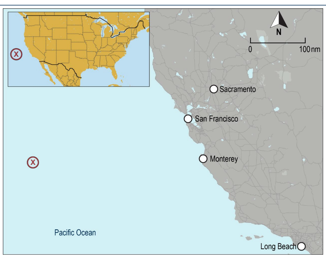
Figure 2. Area where the Blue Dragon fire occurred, as indicated by a red X .