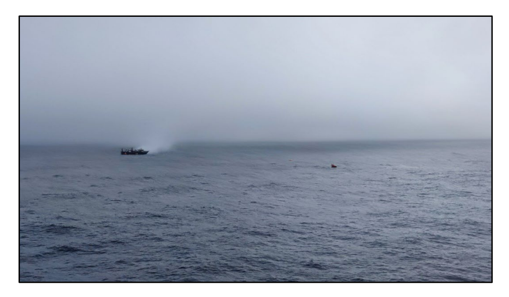
Figure 4 . Blue Dragon smoldering with NordRubicon's rescue boat in foreground.

The second C-27J arrived at 0850 and was on scene when the NordRubicon arrived about 0900. The crew of the NordRubicon deployed the vessel's rescue boat. The Blue Dragon crew left the vessel's EPIRB on board the fishing vessel before again abandoning the vessel to the liferaft to facilitate their transfer to the NordRubicon . The NordRubicon crew secured a tow line to the Blue Dragon liferaft and towed the fishing vessel crew back to the bulker, where they were recovered by 1135. Once the Blue Dragon 's crew was safely on board the NordRubicon , the bulk carrier proceeded to Sacramento, California. The Blue Dragon remained drifting until November 12, when the Blue Dragon II , a similar vessel owned by the same company, towed the hulk (burned vessel) to San Pedro, California.