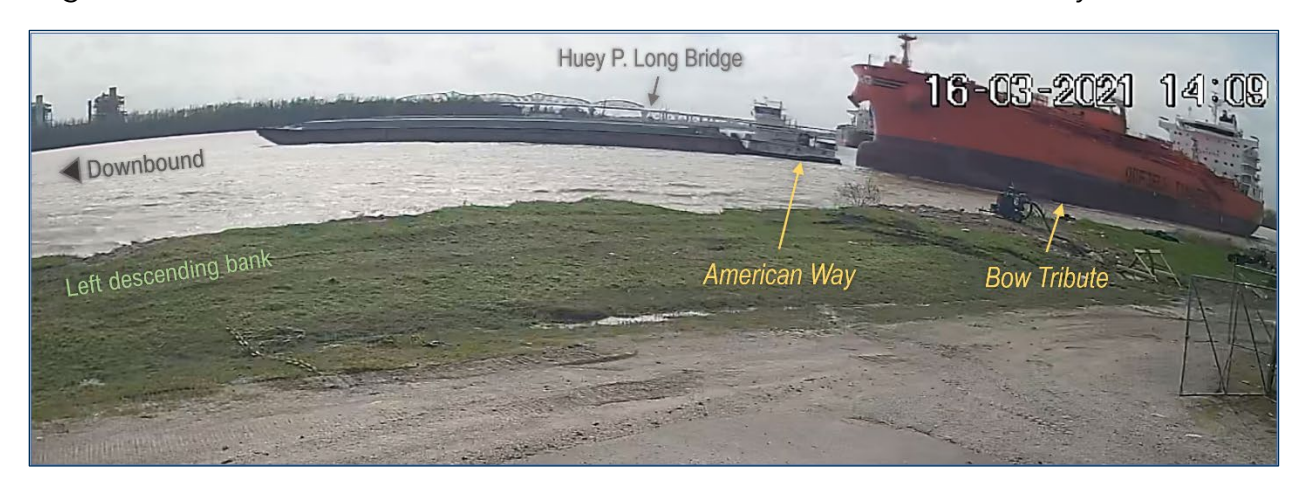
Figure 4. CCTV footage looking upriver at 1521 shows the Bow Tribute near the left descending bank with the American Way by the tanker's starboard bow. (Timestamp is 1 hour 11 minutes behind the actual time.)

At 1520:35, as the stern of the American Way was about 130 feet off the starboard bow of the Bow Tribute , the NOBRA pilot on the Bow Tribute issued a series of helm orders to port and midship, followed by multiple soundings of the ship's whistle. He announced over the radio that the tanker was "colliding at Nine Mile" and requested harbor tug assistance. The pilot then gave various rudder orders and then ordered the engine to full astern to maneuver the Bow Tribute clear of the American Way .