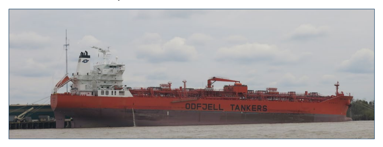
Figure 1. Bow Tribute moored alongside a dock after the casualty.

On March 16, 2021, about 1522 local time, the tanker Bow Tribute was transiting downbound on the Lower Mississippi River in New Orleans, Louisiana, with 29 persons on board. While attempting to overtake a two-barge tow in a river bend, the vessel grounded on the left descending bank near mile 104 and subsequently struck the fender systems protecting two river intakes owned by the city's sewerage and water board. No pollution or injuries were reported. Estimated damage to the vessel ($986,400) and the fender systems ($926,100) totaled $1,912,500.