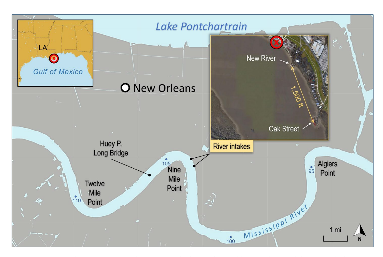
Figure 2. Area where the Bow Tribute grounded as indicated by a red X , and then struck the New River and Oak Street river intake fender systems.

Waterway information River, project depth 45 ft, width 1,800 ft, current about 3.5 kts