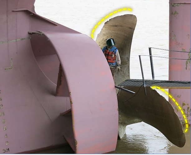
Figure 6. Postcasualty damage to the Bow Tribute's portside aft hull ( left ) and propeller ( right ), as indicated by yellow dashed lines.