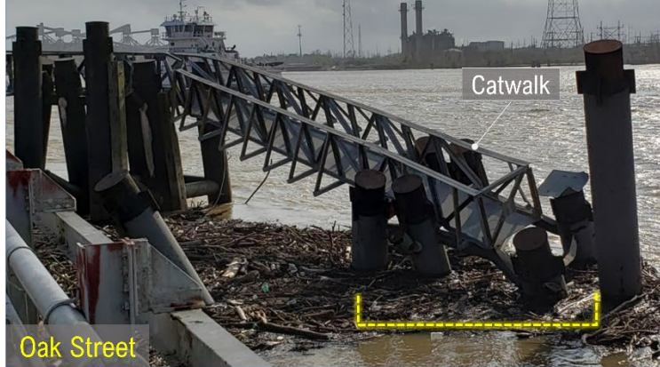
Figure 7. Damage to the river intake fender systems: ( left ) arrow shows damage to the spud barge at New River; ( right ) bracket identifies the damaged catwalk and dolphin piles at Oak Street downriver.