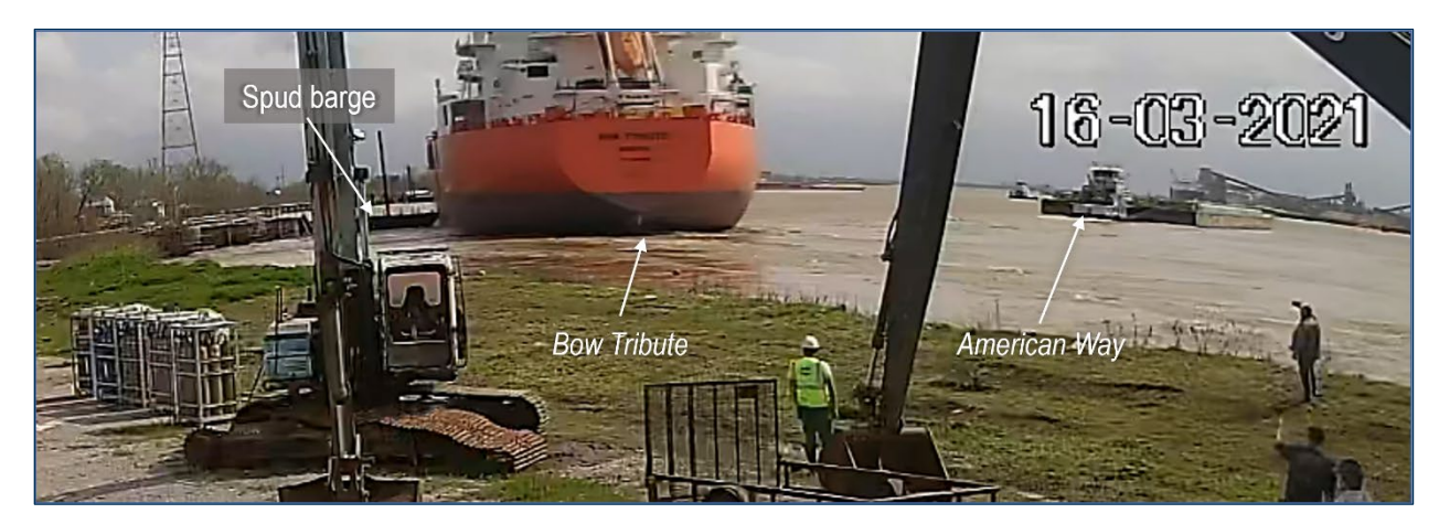
Figure 5. CCTV footage looking downriver at 1522:26 shows the Bow Tribute when it struck the spud barge protecting the New River water intake pipes.

Seconds later, at 1522:26, the port side of the Bow Tribute struck a spud barge moored at mile 104.1 for the New River water intake system owned by the Sewerage and Water Board of New Orleans. The barge was part of a fender system to protect the river intake pipes. After being struck, the barge broke free from its spuds and moorings and drifted downriver. The NOBRA pilot on the tanker issued a series of rudder orders to port and starboard and, at 1522:38, ordered the starboard anchor let go, seeing the American Way was not at risk of being below the Bow Tribute's starboard anchor. The second officer relayed the order to the bosun on the bow, who let go the starboard anchor without delay.