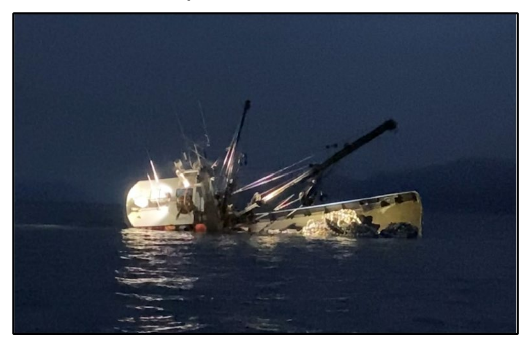
Figure 4. Tenacious, sinking by the bow, about 0345 on July 24.

At 0336, the crew on board the fishing vessel Grand Pa , a 39-foot-long, Seward-based commercial fishing vessel, overheard the distress call and relayed to the Coast Guard that all five Tenacious crewmembers were aboard the skiff with no medical concerns. The Coast Guard then stood down the search and rescue resources. The fishing vessel Wildlife arrived from Whittier at 0642, picked up the Tenacious crew, and towed the skiff to Whittier, arriving at 0748.