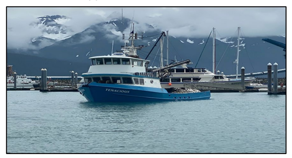
Figure 1. Tenacious under way before the casualty.

On July 24, 2021, about 0326 local time, the fishing vessel Tenacious grounded at the entrance to Wells Passage, 14 miles east of Whittier, Alaska, while transiting to fishing grounds in Prince William Sound.<sup>1</sup> All five crewmembers abandoned the vessel and were rescued by a Good Samaritan vessel. The Tenacious later sank. Two thousand gallons of diesel fuel were on board and not recovered. One minor injury was reported. Loss of the vessel and fishing gear totaled an estimated $660,000.