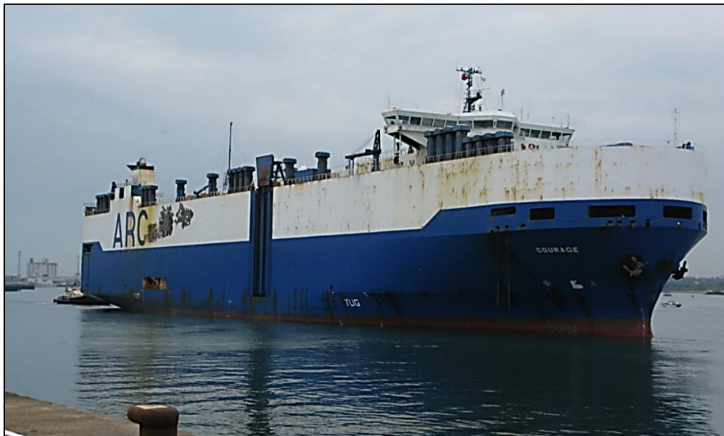
Courage just after the accident, with scorch marks on the starboard aft side as a result of the fire.

About 2215 local time on June 2, 2015, the US-flagged roll-on roll-off (ro-ro) vehicle carrier Courage was transiting from Bremerhaven, Germany, to Southampton, United Kingdom, when a fire broke out in its cargo hold. The accident resulted in extensive damage to the vessel's hold as well as its cargo of vehicles and household goods. As a result of the damage, estimated at $100 million total, the vessel's owners scrapped the vessel.