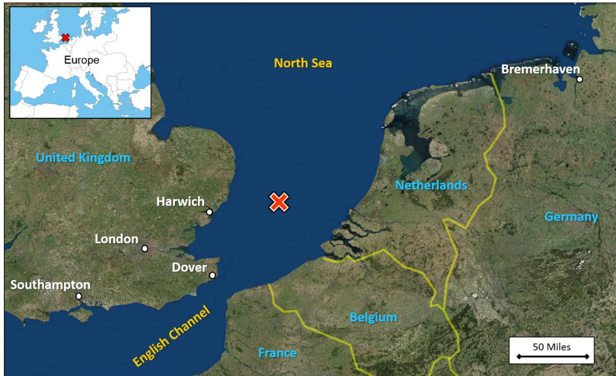
The English Channel and approaches. The red X shows the Courage's approximate location when the fire started. (Background by National Geographic MapMaker Interactive)

The chief engineer released the CO 2 at 2250. The master stated that the smoke intensified for a short period before stopping completely. The crew continued boundary cooling and monitored space temperatures through the next morning.