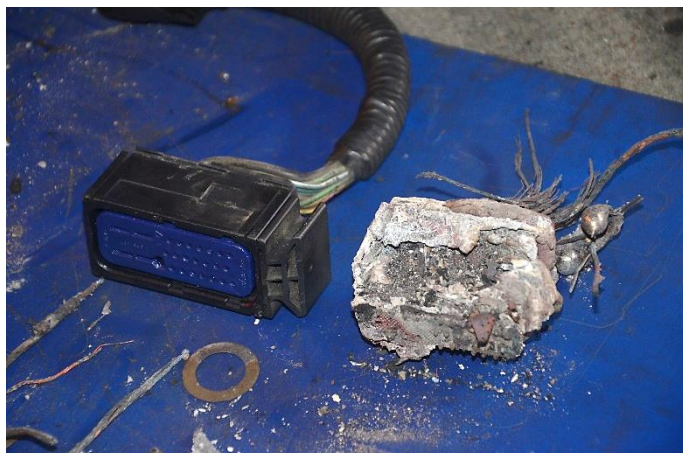
ABS module from 2002 Ford Escape, where the fire likely started on board Courage , pictured next to a sample undamaged module.

The vehicles on the ramp from Deck 8 to Deck 10 were all personally owned vehicles and included a 2002 Ford Escape SUV. Model years 2001 through 2004 Ford Escapes and Mazda Tributes (which shared the same chassis and many components as the Escapes) were the subject of recalls in 2007 and 2010 due to non-crash-related fires or thermal events in the vehicles' engine compartments. Brake fluid leaking from the master cylinder reservoir cap had been reported to enter the vehicles' automatic braking system (ABS) wiring harness electrical connectors, causing short-circuits, melting, and fires. As of early 2012, the National Highway Traffic Safety Administration (NHTSA) was aware of 260 vehicles that had experienced non-crash-related fires or thermal events. 1 The Ford Escape that was destroyed by the fire in the Courage cargo hold had not been serviced to replace the faulty parts that were the subject of the Ford recalls. The owner had been overseas for a number of years and was not aware of the recalls prior to the accident.