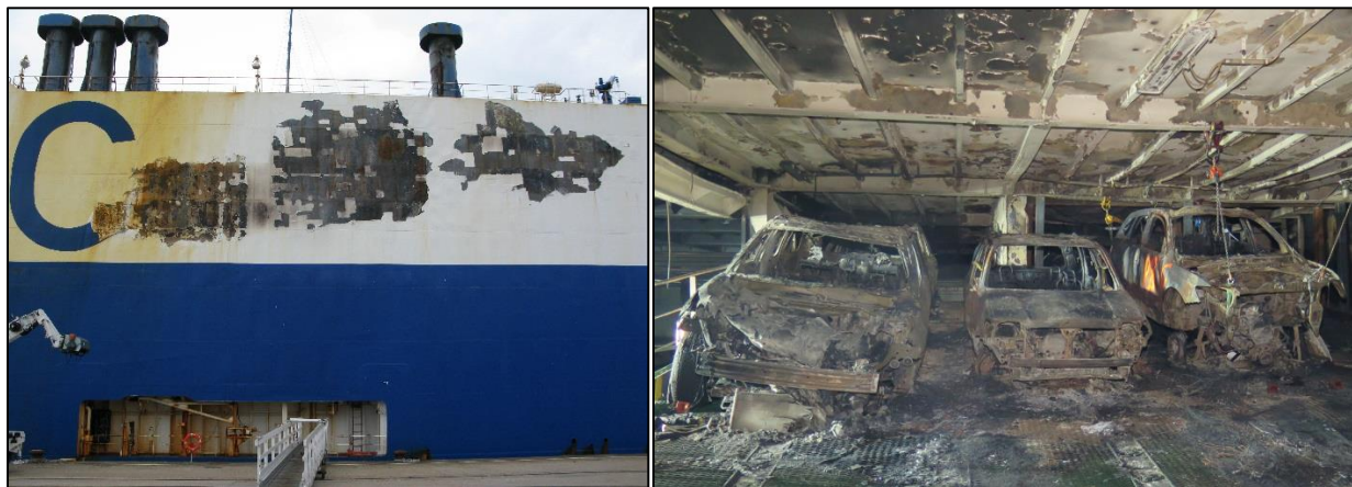
Left photo shows exterior damage to Courage starboard side in the vicinity of the fire. Right photo shows damaged ramp and destroyed vehicles near the origin of the fire.

The vehicles on the ramp from Deck 8 to Deck 10 were all personally owned vehicles and included a 2002 Ford Escape SUV. Model years 2001 through 2004 Ford Escapes and Mazda Tributes (which shared the same chassis and many components as the Escapes) were the subject of recalls in 2007 and 2010 due to non-crash-related fires or thermal events in the vehicles' engine compartments. Brake fluid leaking from the master cylinder reservoir cap had been reported to enter the vehicles' automatic braking system (ABS) wiring harness electrical connectors, causing short-circuits, melting, and fires. As of early 2012, the National Highway Traffic Safety Administration (NHTSA) was aware of 260 vehicles that had experienced non-crash-related fires or thermal events. 1 The Ford Escape that was destroyed by the fire in the Courage cargo hold had not been serviced to replace the faulty parts that were the subject of the Ford recalls. The owner had been overseas for a number of years and was not aware of the recalls prior to the accident.