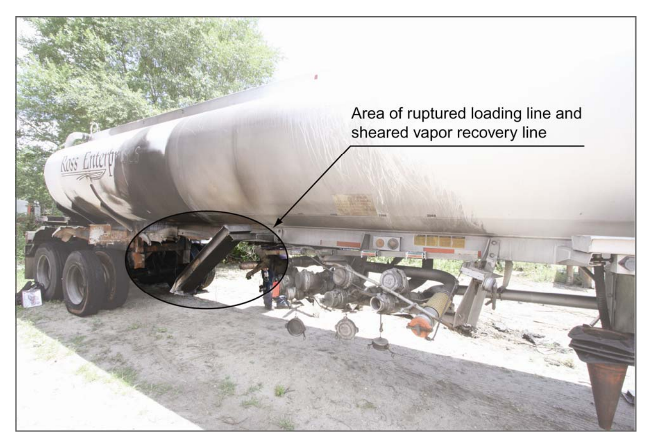
Figure 2. Rear passenger side of accident cargo tank truck showing external damage from collision and fire.

13 gallons of gasoline contained inside loading line 4 were released onto the automobile below. The gasoline was ignited, most likely by an unknown ignition source from the automobile, and a fire engulfed the automobile, loading line 4, and the vapor recovery line. The self-closing stop valve on the fourth compartment of the cargo tank functioned properly, and the 2,999 gallons of fuel contained in the compartment prior to the accident were safely offloaded after the fire was extinguished. Consequently, the release of gasoline and the subsequent fire likely would not have occurred if the cargo tank's loading lines had been empty.