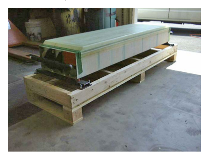
Figure 2. Approved battery pack in covered fiberglass case that is bolted to wooden base. (A wooden box that covers the fiberglass case is then secured to the wooden base.)

Figure 1. Approved battery pack in fiberglass case. The battery pack is without its cover and shows the modules secured in the fiberglass case.