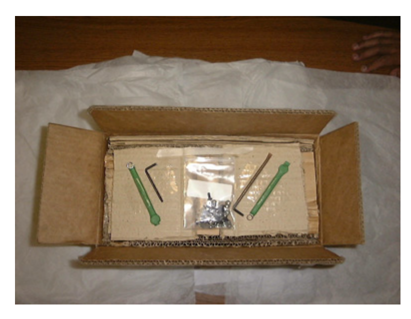
Figure 4. Tools taped to the top of the fiberboard lining covering the sample battery modules in figure 3, as was done with the accident package.

Figure 3. Sample modules in a 4G fiberboard box, as were the accident modules.