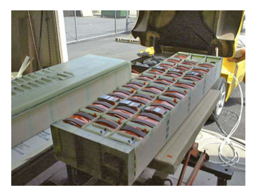
Figure 1. Approved battery pack in fiberglass case. The battery pack is without its cover and shows the modules secured in the fiberglass case.