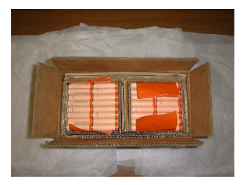
Figure 3. Sample modules in a 4G fiberboard box, as were the accident modules.

The box used to transport the accident modules had two compartments, one for each module. The box, including the space between the compartments, was lined with a double layer of fiberboard. The equipment to install the modules in the automobile battery was taped to the top of the fiberboard lining over the modules. The equipment consisted of two 2-inch-long metal Allen wrenches, two shrink-wrapped metal combination wrenches, and a bag of nuts and bolts. The total package weighed 30 pounds. (The modules were meant to replace faulty modules in a prototype lithium battery pack. The modules of the prototype lithium battery can be removed and replaced separately.)