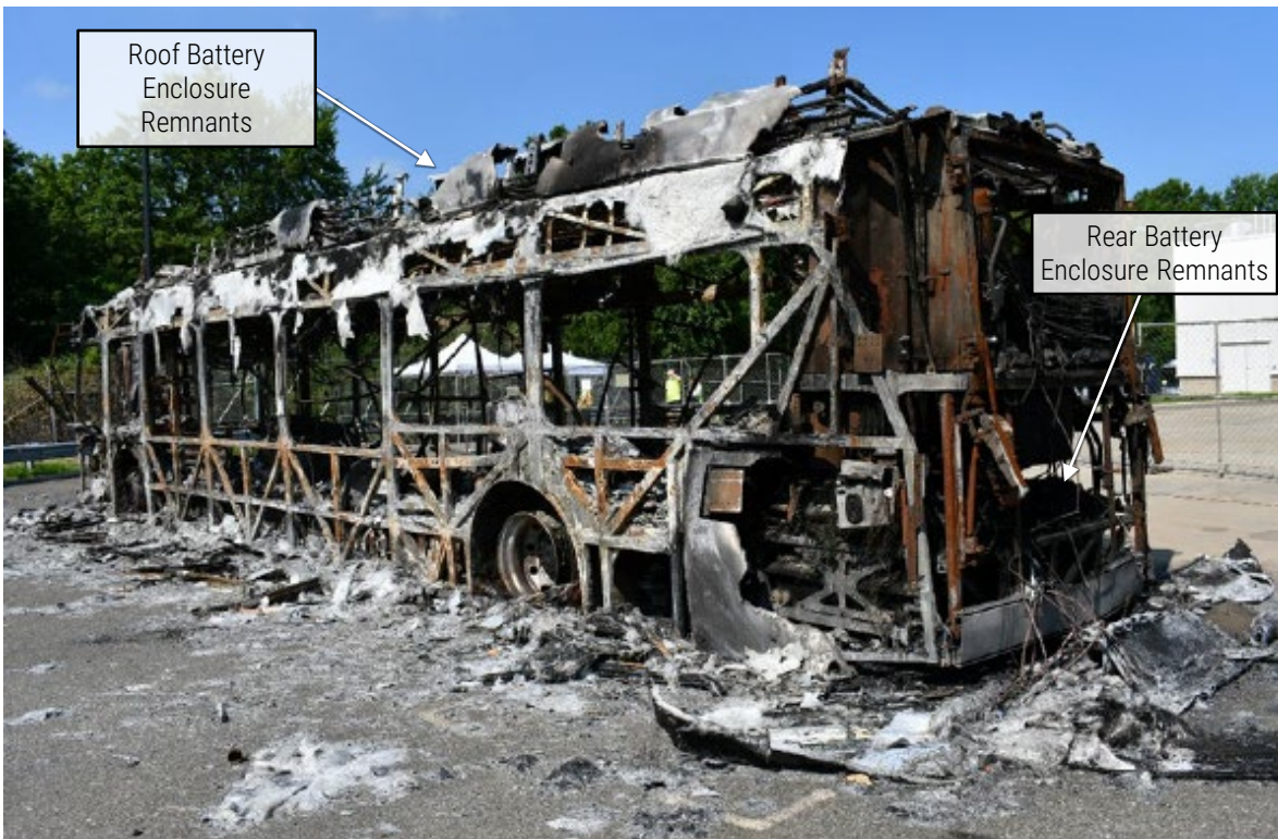
Figure 4. View of the burned transit bus from the left rear corner of the bus.