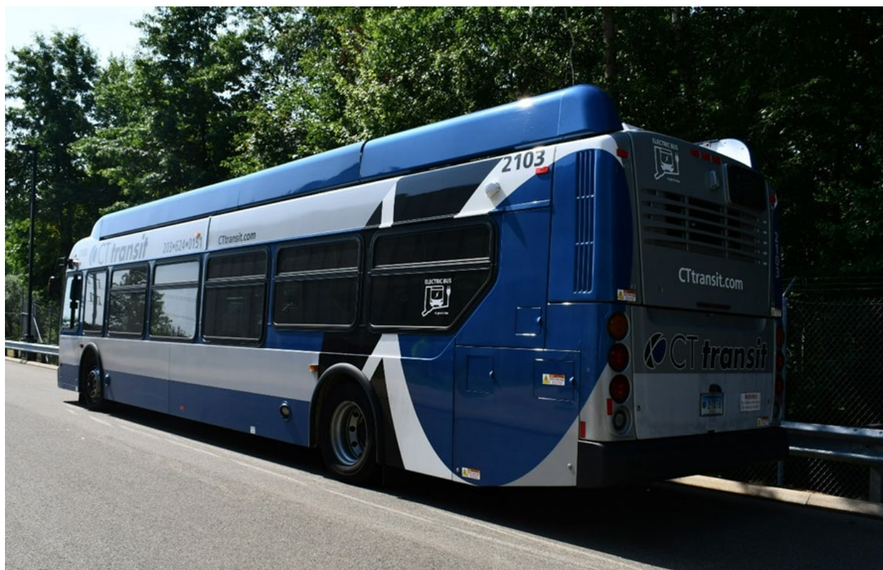
Figure 1. Image of an exemplar CTtransit bus, viewed from the left rear.