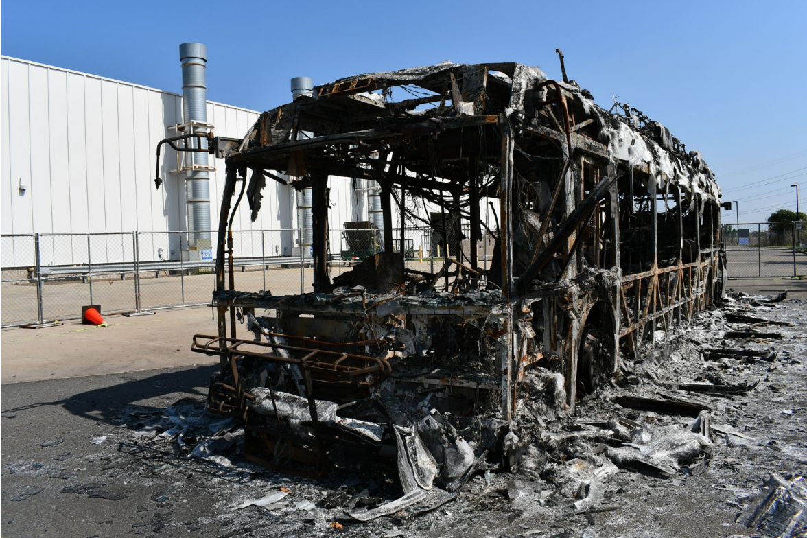
Figure 3. View from the front driver's side of the battery electric transit bus after the fire.