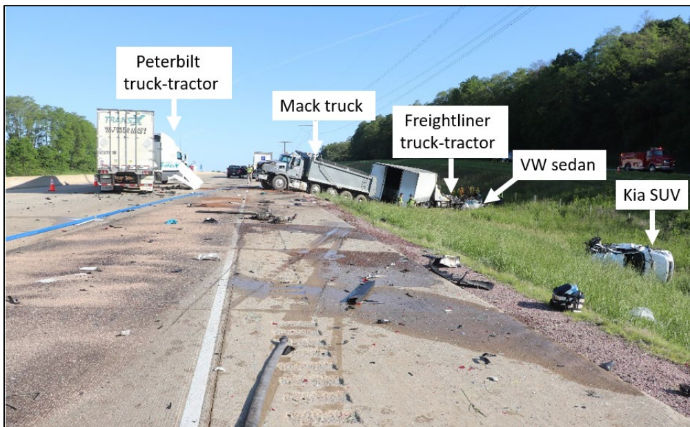
Figure 1. View to the north from the shoulder of northbound Interstate 39, showing the final rest positions of some of the involved vehicles.

On June 12, 2020, near the Township of Arlington, Wisconsin, a queue of slowed and stopped traffic formed on Interstate 39 because of two previous traffic collisions. 1 About 6:45 a.m., a 2013 Freightliner truck-tractor in combination with a 2017 Utility semitrailer struck the end vehicle in the queue, causing a crash involving eight vehicles. Four vehicle occupants died and three were seriously injured.