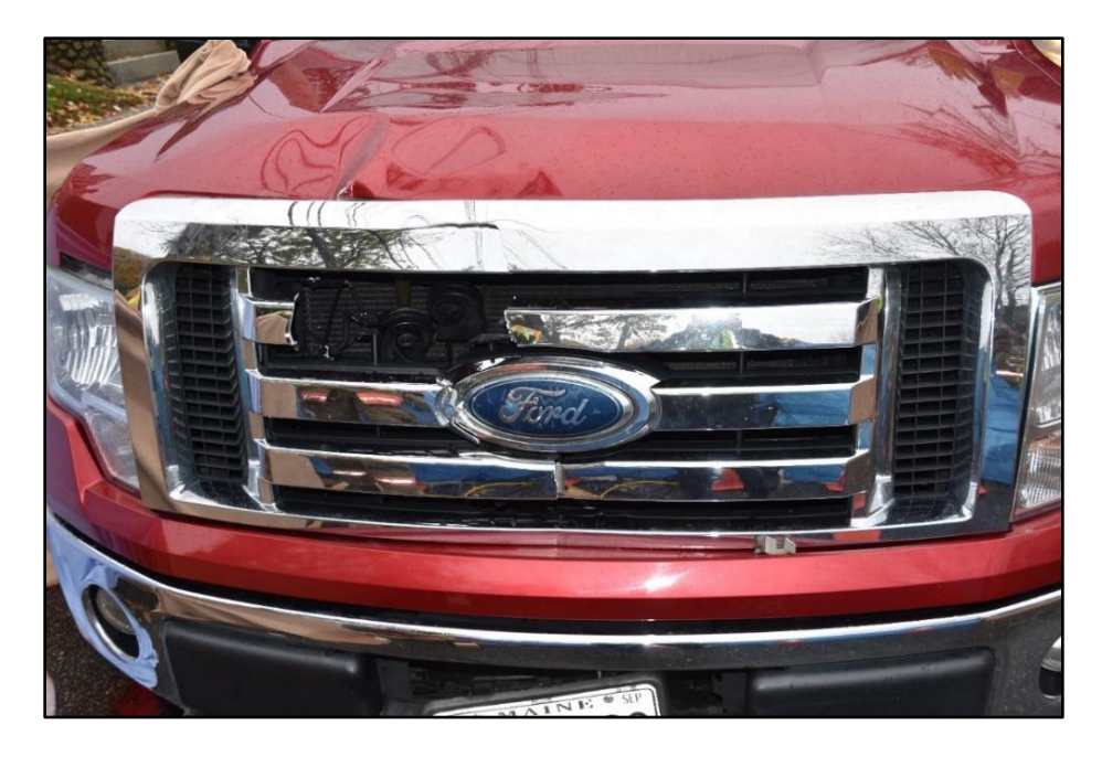
Figure 3. Closeup of crash vehicle showing damage to hood and grille.