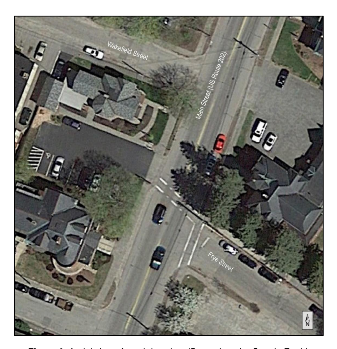
Figure 2. Aerial view of crash location.

Main Street is classified as an urban arterial roadway. It runs northeast to southwest and in the area of the crash has two lanes separated by a double yellow line. The neighborhood contains a mix of residences and office complexes (figure 2). A hospital is situated just south of the crash site. Traffic in the area is moderate to heavy during the time the crash occurred, according to the police reconstruction report. The posted speed limit on Main Street is 25 mph.