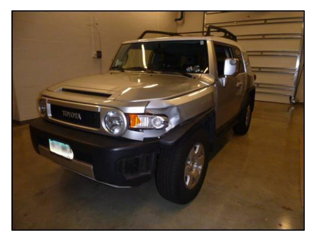
Figure 3. Front view of crash SUV showing damage to left fender near turn signal assembly.

The crash vehicle was a 2007 Toyota FJ Cruiser SUV. The driver reported that the vehicle was in working order before the crash. Damage to the SUV postcrash included material transfer on the left front fender and front bumper and hood. The left front fender was displaced and dented, and the corner pad of the left front bumper was torn off (figure 3). The left side of the hood was also dented.