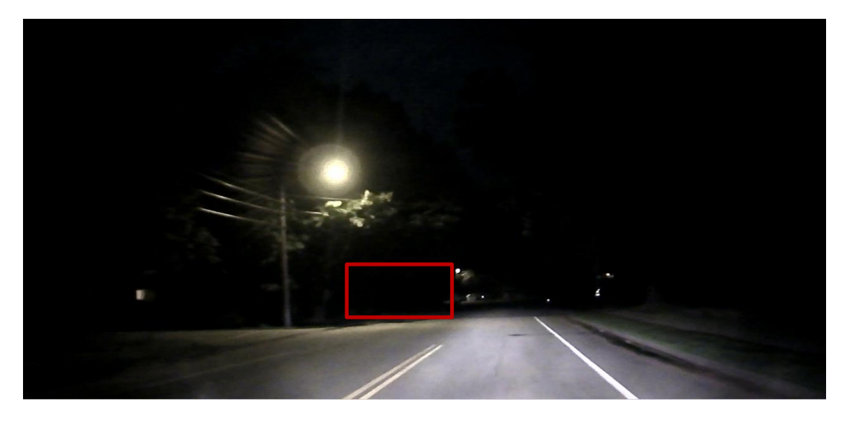
Figure 4. Snapshot from video taken during police conspicuity test. Pedestrian wearing reflective vest was standing in area outlined by red rectangle.

The Old Saybrook Police Department conducted a conspicuity test several hours after the collision (which occurred during twilight). A police vehicle equipped with a forward-facing camera traveled down Maple Avenue at two speeds, 30 mph and 35 mph. A pedestrian wearing a reflective vest stood on the shoulder at the east edge of Maple Avenue. In the test, the pedestrian was not visible to the driver (figure 4) until perpendicular to the outer left edge of the police vehicle's headlight beam.