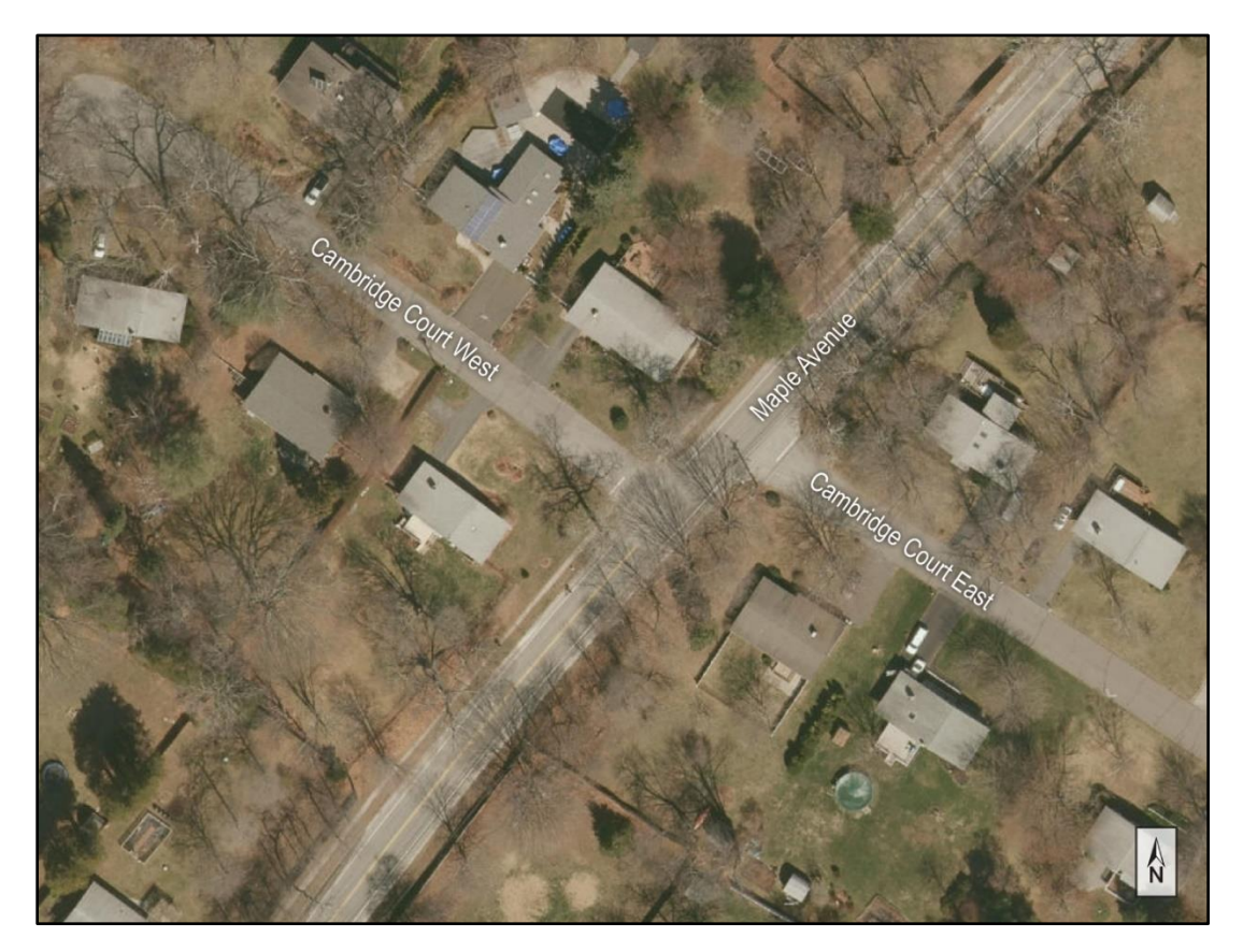
Figure 2. Aerial view of crash location showing intersection of Maple Avenue with Cambridge Court East and Cambridge Court West.