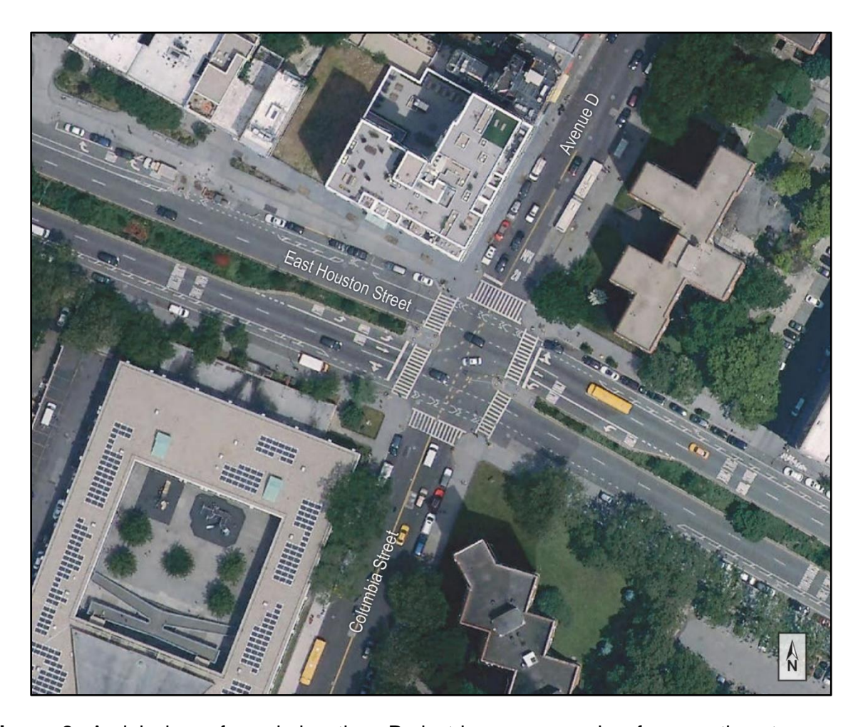
Figure 2. Aerial view of crash location. Pedestrian was crossing from northeast corner to southeast corner and had stopped on median before proceeding across intersection. Bus was turning left from Avenue D onto East Houston Street.

Hudson River on the west. (East Houston and West Houston streets separate at Broadway.) East Houston Street has two travel lanes and one dedicated parking lane in each direction. A raised concrete median separates the eastbound and westbound lanes. The speed limit on East Houston Street is 25 mph.