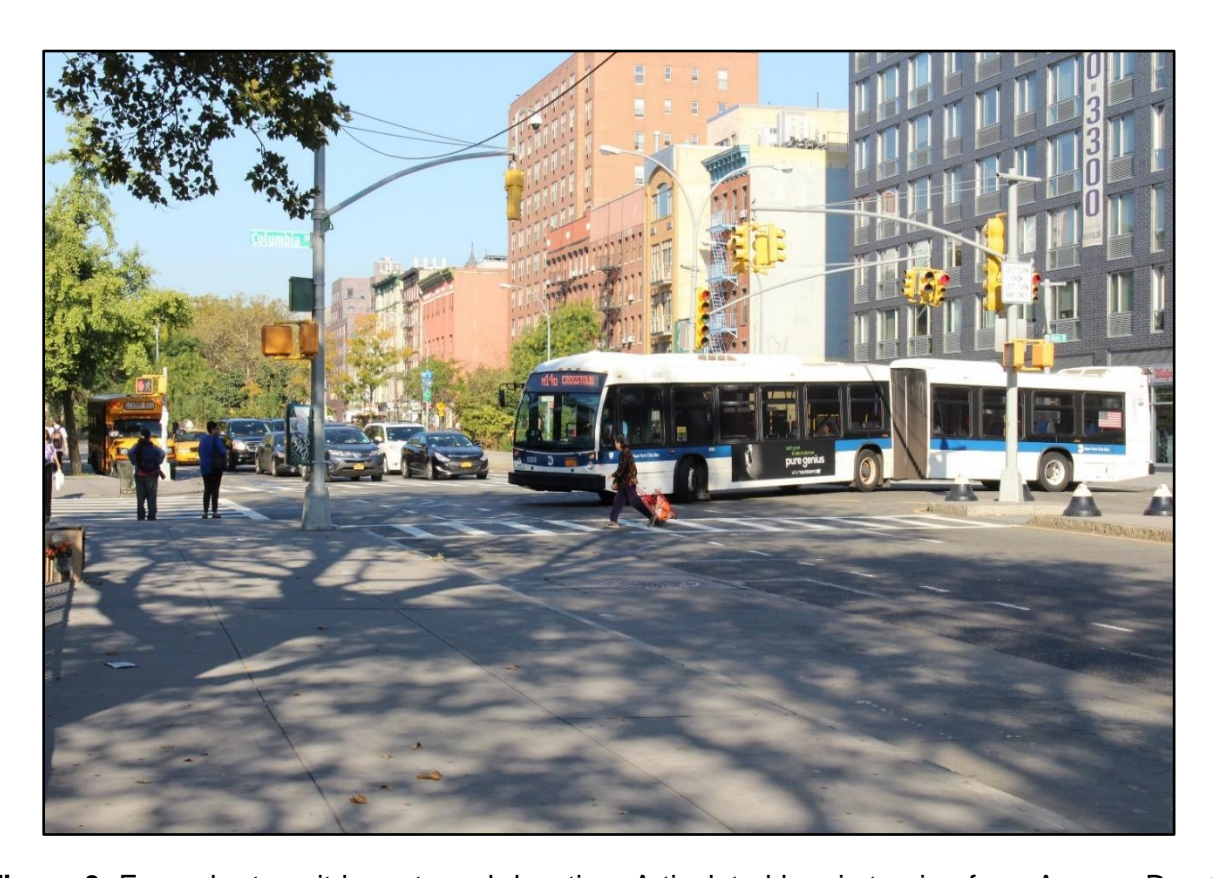
Figure 3. Exemplar transit bus at crash location. Articulated bus is turning from Avenue D onto East Houston Street, same location and same maneuver crash bus was executing when it struck pedestrian.

The 2012 Nova Bus Artic model low-floor articulated bus was designed for high ridership transit routes. The bus was 62 feet long and had a maximum occupancy of 112 persons, seated and standing. The MTA documented regular preventive maintenance on the bus. Records listed no recalls for the bus. The MTA's Technical Service Division, in the presence of a representative from the New York State Public Transportation Safety Board, performed a postcrash inspection and brake deceleration test on the bus at the MTA maintenance depot. No mechanical defects were found. Figure 3 shows an exemplar MTA bus at the crash scene.