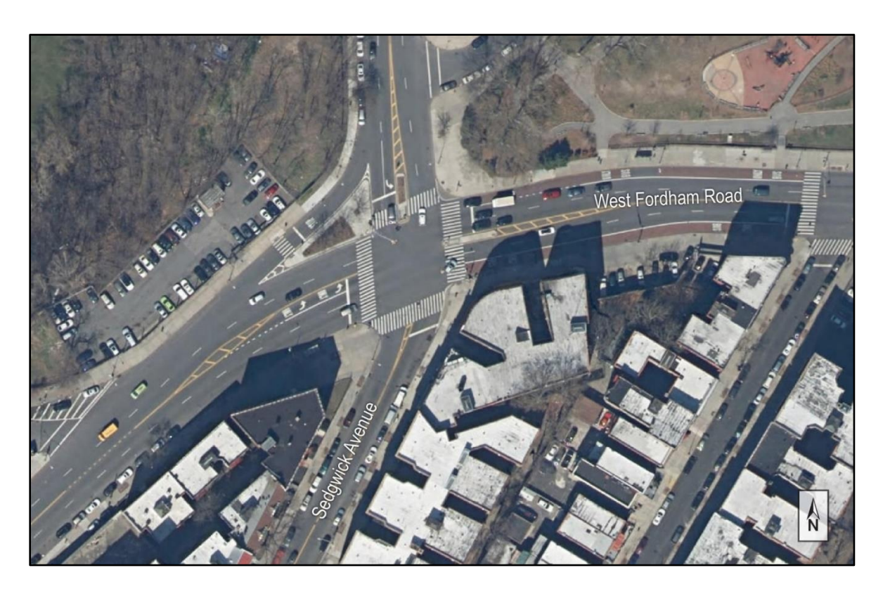
Figure 2 . Aerial view of crash intersection showing crosswalks and other road markings on West Fordham Road and Sedgwick Avenue, with apartment buildings to south and parkland to north.

West Fordham Road is a commercial corridor in a residential zone. The area of the crash includes dozens of businesses, single-family houses, a public park, and nine apartment buildings that contain about 1,130 apartments (figure 2). The roadway runs east and west, with a double yellow line separating opposing lanes. Both sides of the roadway have two through lanes and one dedicated left-turn lane. In the eastbound direction, West Fordham Road has a significant uphill grade. Traffic signals control the intersection with Sedgwick Avenue (refer to figure 1), and all the crosswalks are well marked. The posted speed limit is 25 mph on both roads.