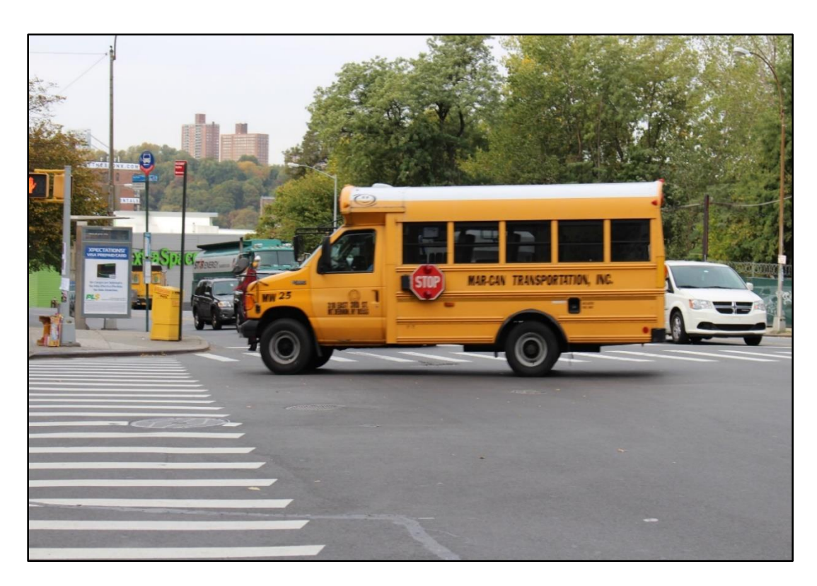
Figure 3. School bus similar to that involved in crash, shown turning left from West Fordham Road onto Sedgwick Avenue at crash intersection. (Crash bus was turning right from eastbound West Fordham Road, in lane where green truck can be seen.) View is west from crosswalk where pedestrian was struck.

The crash vehicle was a 2007 Ford school bus (figure 3). The bus had a tracking device that used global positioning system technology to record its location and speed. According to the tracking data, the crash occurred at 12:23 p.m., and the bus was traveling 9 mph.