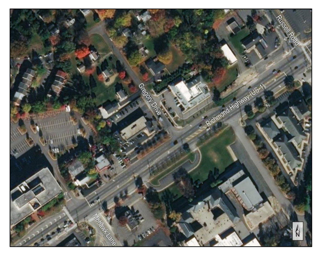
Figure 2. Aerial view of crash location showing nearest intersection to crash site (Gregory Drive), nearest pedestrian crosswalks (at Russell Road and Mohawk Lane), surrounding buildings and parking lots, and nearby residential neighborhood.

right-turn-only lane is about 15 feet wide. The speed limit in this area of Richmond Highway is 45 mph. Figure 2 is an aerial view of the area near the crash site.