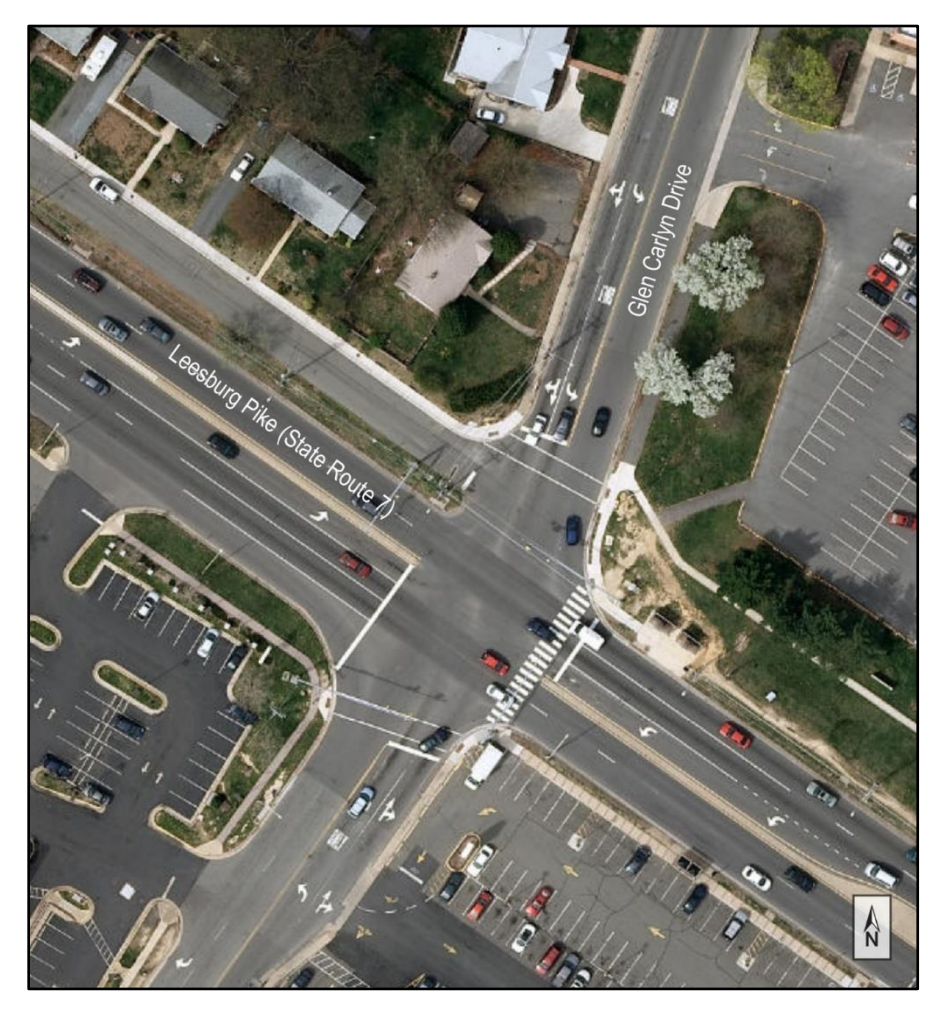
Figure 2. Aerial view of crash location showing intersecting roadways, crosswalk, and surrounding businesses. (Base map by Google Earth)

The area around the intersection includes sidewalks for pedestrians as well as marked pedestrian crosswalks (figure 2). Pedestrian-walk phases are incorporated in the timing sequence for the traffic lights at the intersection. A shopping center is located on the south side of Leesburg Pike. Metrobus stops and shelters are found on both sides of the highway—two shelters near the northeast corner of the intersection, and a smaller shelter in the middle of the block on the south side of Leesburg Pike (refer to figure 1). Local residents and law enforcement officers told investigators that pedestrian and bus traffic in the area is heavy.