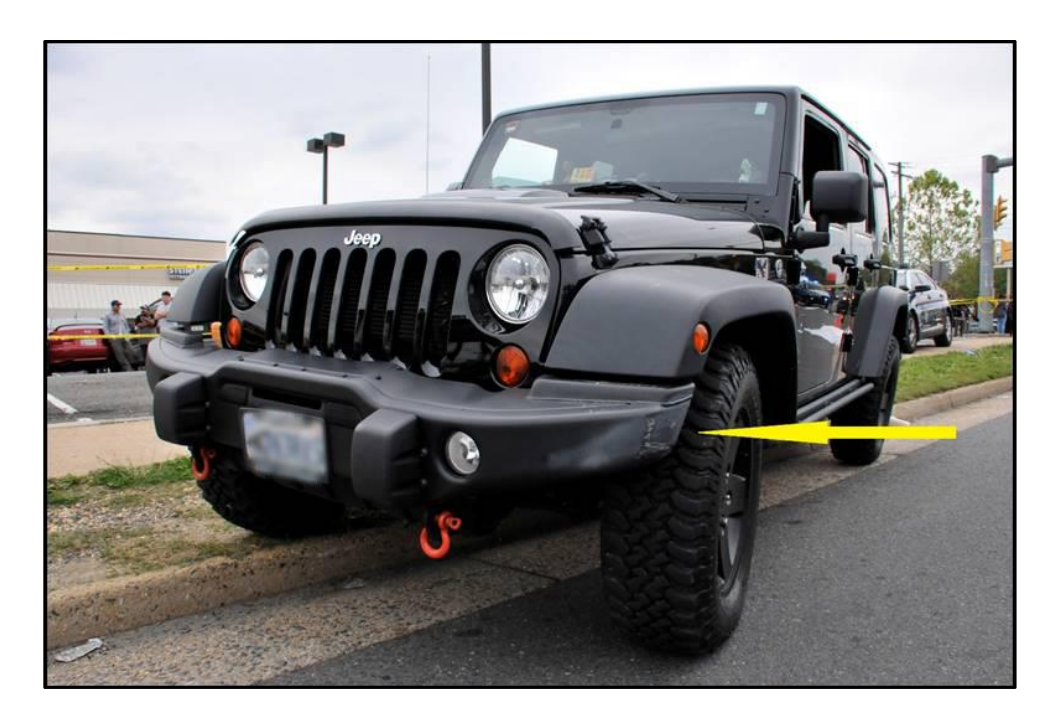
Figure 3. Photograph showing minor contact damage (arrow) to left front bumper of SUV.

The crash vehicle was a 2012 Jeep Wrangler SUV. The owner purchased the vehicle in 2012 and was familiar with its operation. He stated that the SUV had no mechanical problems and had been in only one other collision, a minor one in 2012. The SUV was examined on the scene by law enforcement officers and NTSB investigators, who observed minor damage to the area of the left front bumper (figure 3).