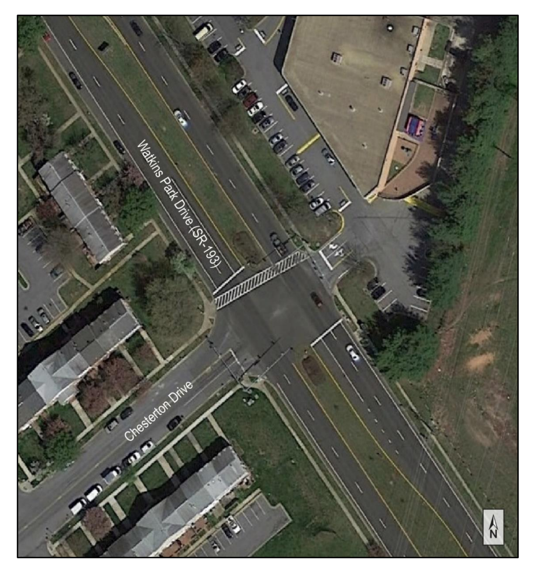
Figure 2. Aerial view of intersection of Watkins Park Drive and Chesterton Drive in Upper Marlboro, also showing parking lot and exit (upper right) near crash site.

at the intersection. The lanes of opposing travel are separated by a 25-foot-wide grassy median. Each outer edge of the roadway is bordered by a raised concrete curb and a sidewalk.