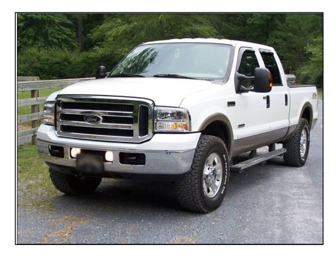
Figure 3. Photograph of pickup truck of same make and model as vehicle involved in crash.