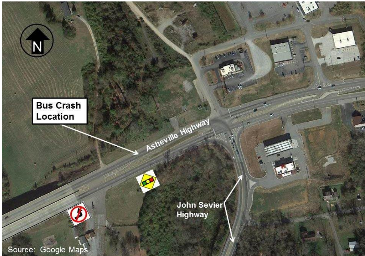
Figure 4. Locations of the advance “no left turn” and “signal ahead” signs on eastbound Asheville Highway, approaching the intersection with John Sevier Highway from the west (precrash route of eastbound bus #44).