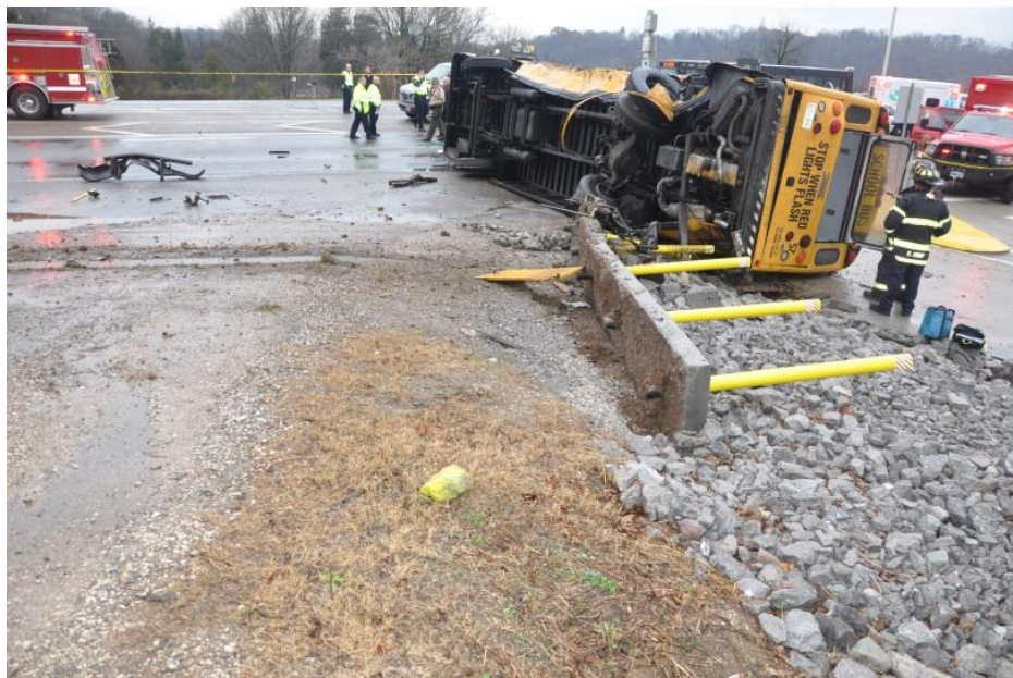
Figure 3. Bus #57 at final rest on its right side and the overturned barricade.

The most recent resurfacing on Asheville Highway in the vicinity of the crash occurred on March 11, 2005. At the request of the NTSB, the Tennessee Department of Transportation Materials Division conducted pavement friction testing on Asheville Highway in the crash area.