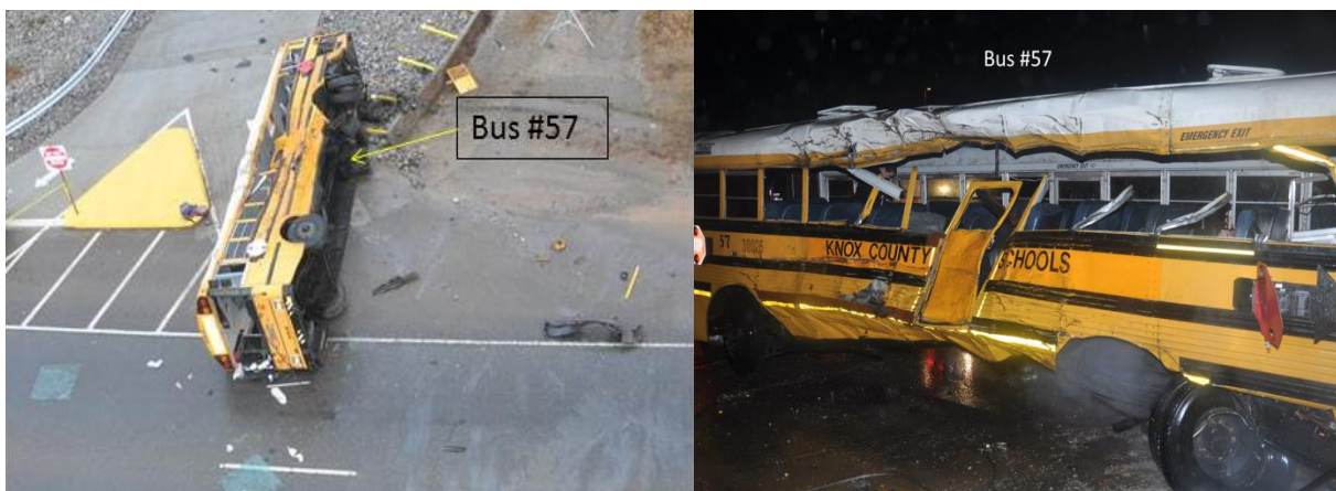
Figure 6. At left, bus #57 at final rest on its side. At right, view of bus #57 after it had been returned to an upright position, showing impact damage along the left (driver) side.

Significant damage, consisting of scrapes and dents, began at the left front wheel well and extended along the entire left side. The left sidewall was deformed inward; the deformation was most severe near the midpoint of the bus. The approximate intrusion distances into the passenger compartment measured 23 inches at the top of the windows, 15 inches along the lower portion of the window line, and 5 inches at the floor level. The panel at the bottom of the bus body had been pushed inward about 22 inches. There was a large tear in the left sidewall, beginning vertically at the level of the top of the wheel well and horizontally 78 inches aft of the front wheel well. The tear extended horizontally to 109 inches aft of the front wheel well. (See figure 6.)