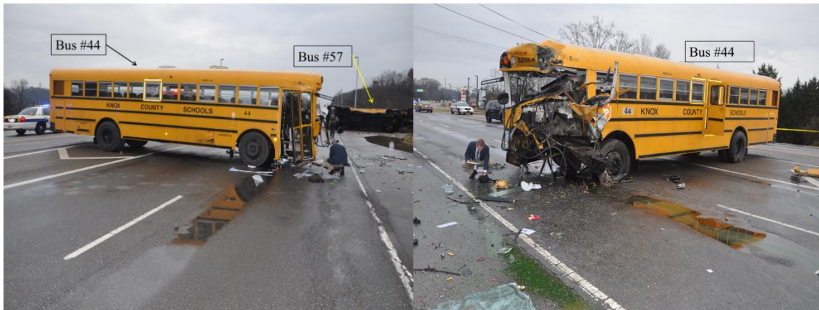
Figure 5. At left, bus #44 in final rest position, showing the right side of the bus (overturned bus #57 can be seen in the photo background). At right, the focus is on damage to the left front of bus #44. [Note: In both photos, the bright yellow tape used on the bus exterior to highlight emergency exits is visible.]

loading door were crushed in about 3 inches at the bottom. No significant damage was noted on the right (passenger) side or the back of the bus. (See figure 5.)