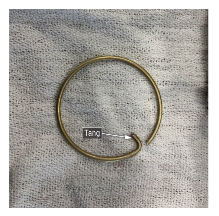
Figure 2. Exemplar lock ring.