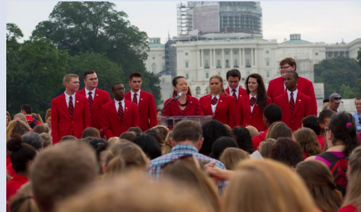
Vice Chairman addresses youth on Capitol steps