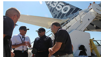
NTSB Chairman Hart (center)