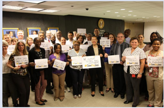
NTSB HQ staff show support for Global Road Safety Week