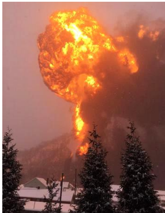
Figure 1. Fireball eruption from Mount Carbon, West Virginia derailment scene, February 16, 2015.

Emergency responders reported that the first thermal failure occurred about 25 minutes after the accident. By about 65 minutes after the accident, at least four thermal failures with energetic fireball eruptions had occurred (see Figure 1). The 13th and last thermal failure occurred more than 10 hours after the accident.