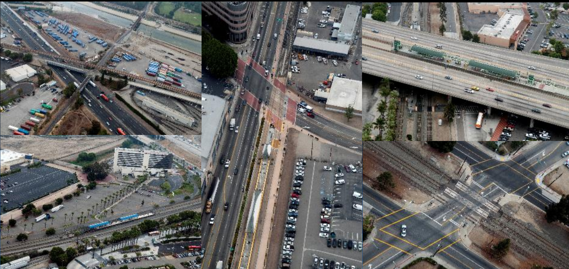
Poor Grade Crossing design for traffic patterns