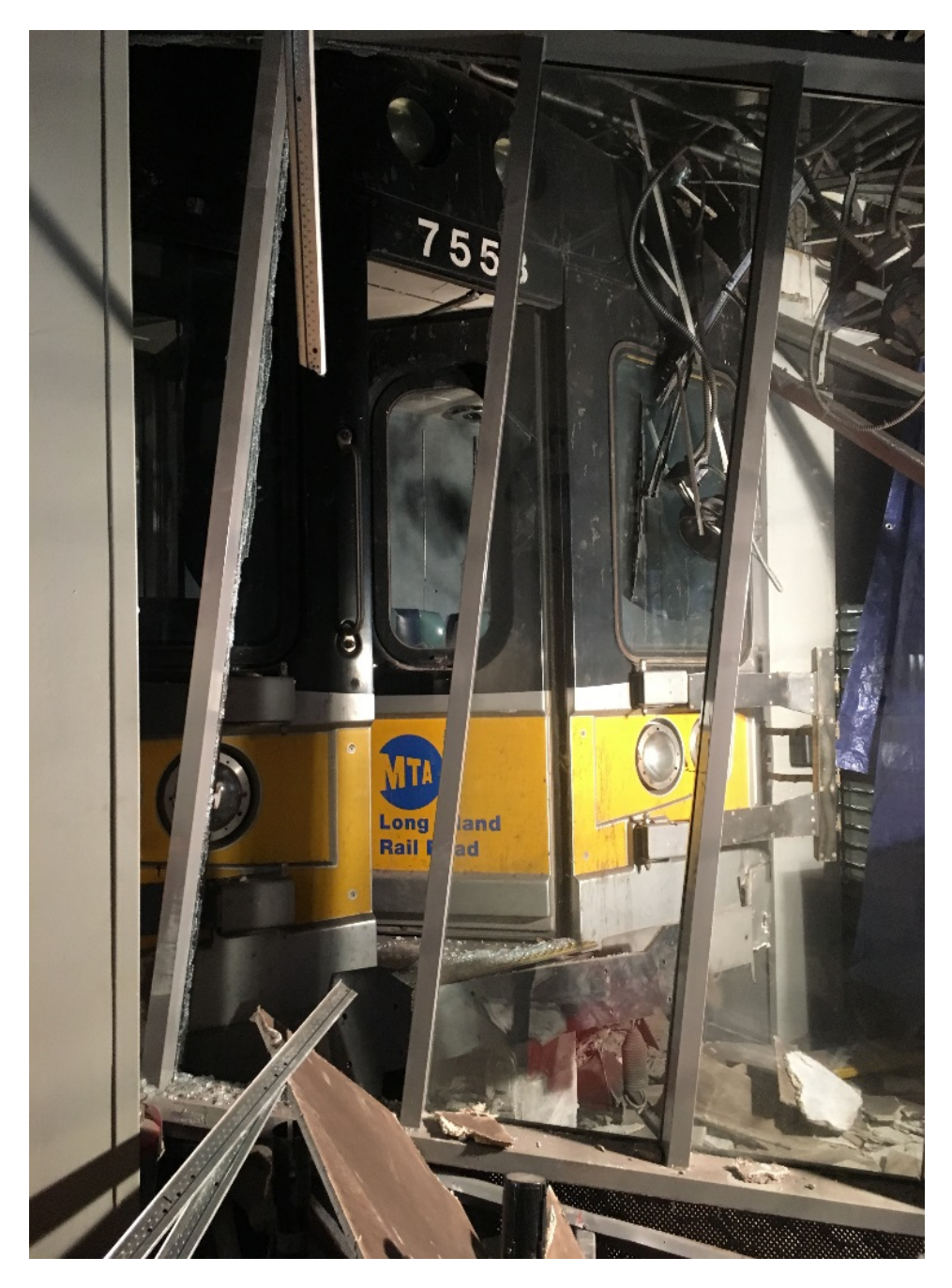
Figure 1. The accident train's lead car.