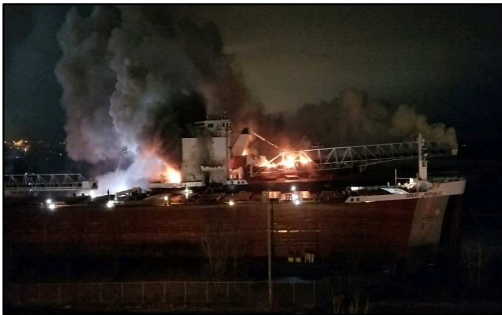
Vessel fire at 2209. Billowing smoke pours from the vessel as fire in the aft part of the deckhouse spreads up the conveyor belt on the boom.

While the Indiana Harbor shipkeeper was checking on the vessel, the H Hansen foreman called a friend who worked as a firefighter for the local fire department to inform him of a potential fire. The firefighter immediately contacted the 911 dispatcher at 2042 and reported the fire. The first fire truck arrived at the vessel at 2055, 45 minutes after the Great Lakes Trader chief engineer first saw the smoke.