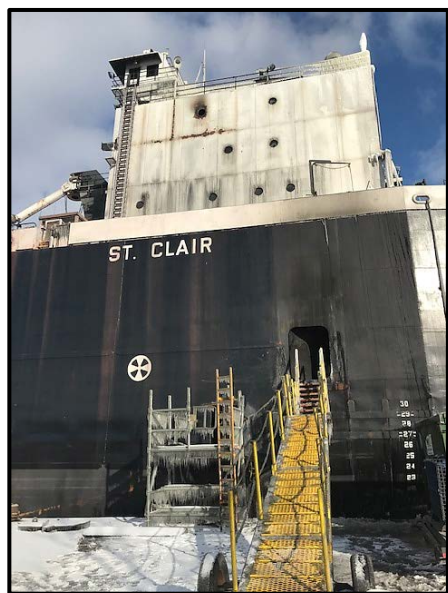
Portside gangway entrance following the extinguishing of the fire.

Michigan CAT were on board conducting work on the vessel's starboard generator. However, Michigan CAT stated that its personnel were not on board the vessel the day of the fire.