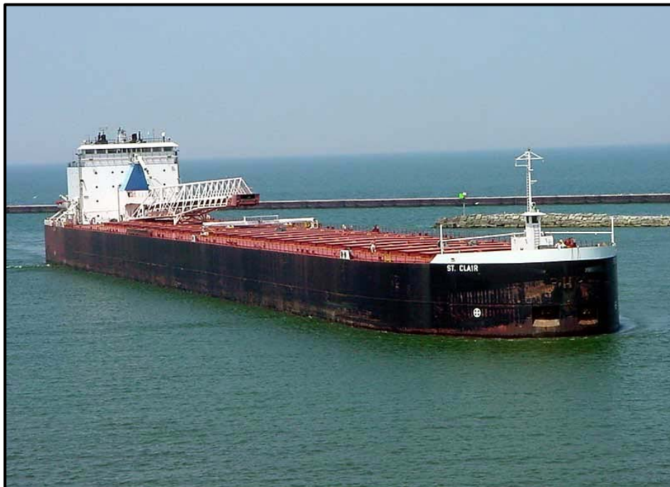
Bulk carrier St. Clair before the accident.

About 2010 local time on February 16, 2019, a fire was reported on the bulk carrier St. Clair while the vessel was laid-up for the winter at the CSX TORCO Iron Ore Terminal (TORCO dock) at the mouth of the Maumee River in Toledo, Ohio. No one was on board. The fire was extinguished approximately 36 hours later by shoreside firefighters. No pollution or injuries were reported. The estimated property damage exceeded $150 million.