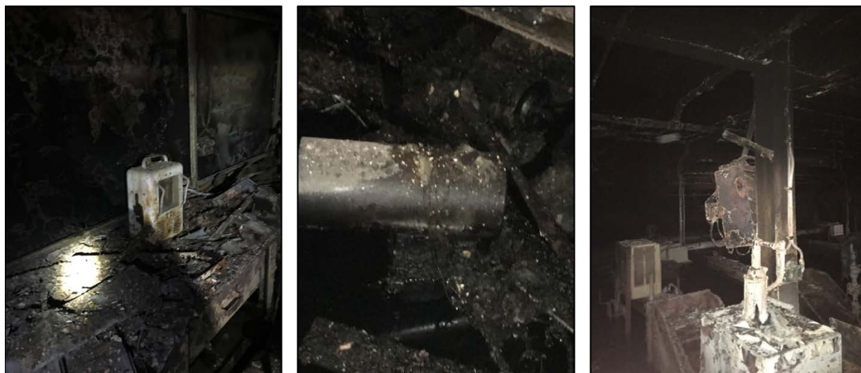
Space heaters located in the engine room break area following the fire: (left) an electric heater on the workshop bench, (center) a propane heater on the deck of the workshop, and (right) a fixed electric heater located forward of the steering gear.

There was a total of six heaters, five electronic and one propane, located in the area of the workshop and the steering gear. A red canvas tarp was hung around the steering gear to help keep the area heated while the workers were taking their breaks. The electronic heaters were routinely left on after the contractors departed the vessel at the end of the day to keep the space warm.