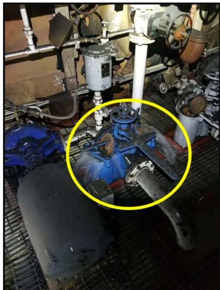
As encircled, the seawater duplex strainer to the emergency fire pump in the lower level of the engine room leaking water.