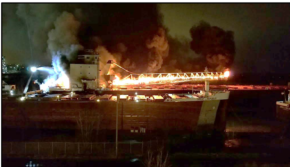
Vessel fire about 10 minutes later, at 2220. The cargo conveyor boom is completely engulfed in flames

The fire burned within the engine room spaces, the entire superstructure, and the self-unloading belt throughout the port- and starboard-side conveyor tunnels to the bow, as well as onto the cargo conveyor boom belt above the main deck.