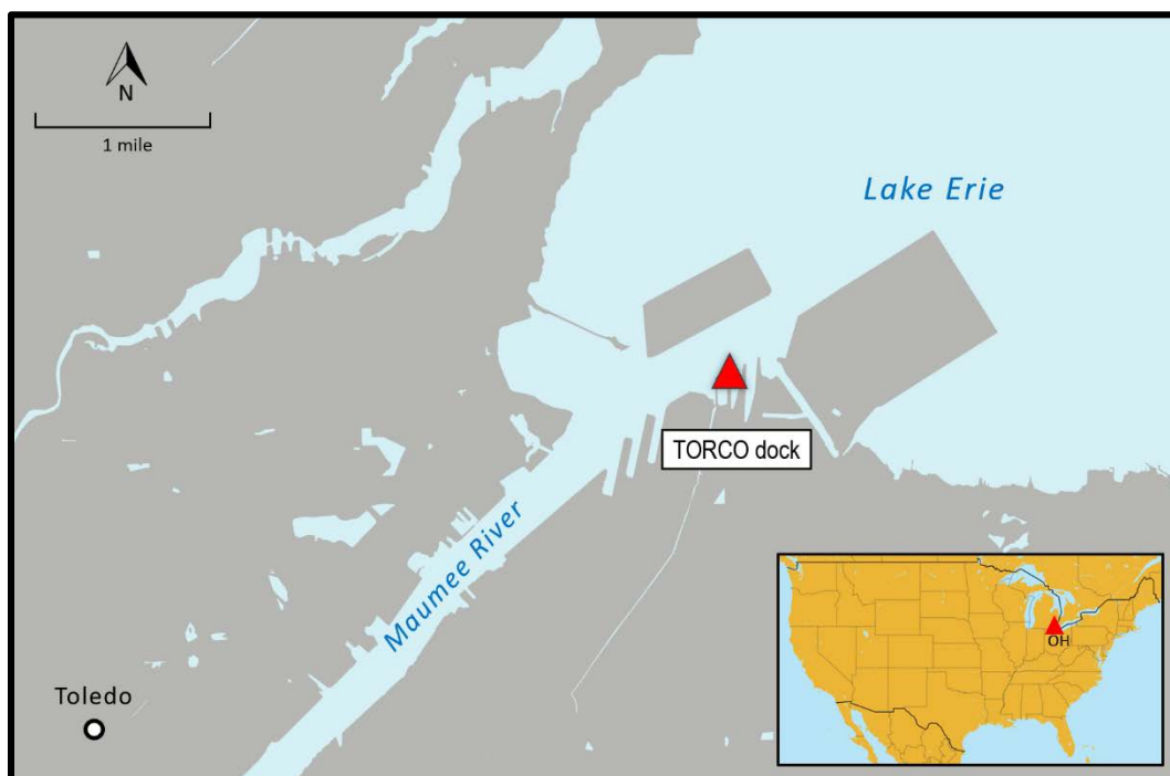
Location where the St. Clair caught fire, as indicated by the red triangle.