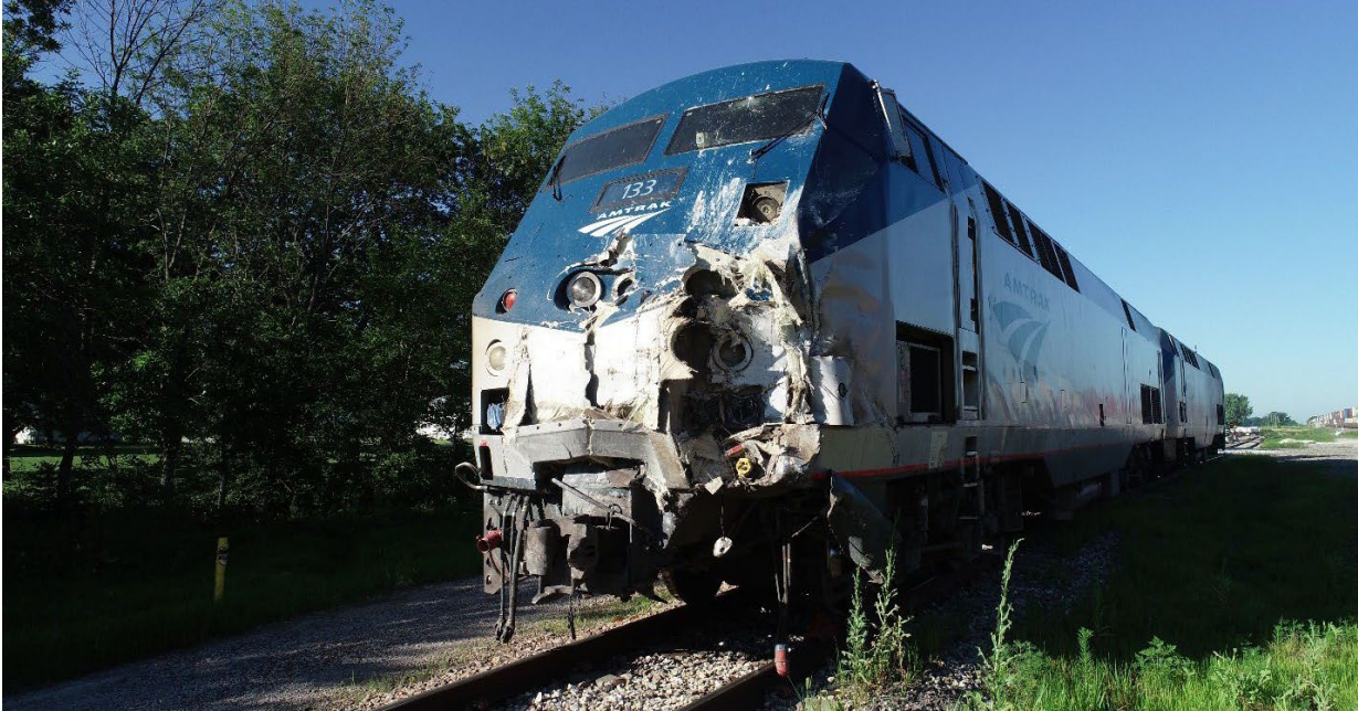
Figure 4. Damage to the front-left bulkhead of the lead locomotive.

The NTSB’s postcollision examination of the truck’s wreckage on June 30, 2022, and later review of locomotive image recorder data identified the left-rear sidewall panel of the truck as the point of impact. The collision spun the truck counterclockwise and separated the cab and dump bed from the chassis.