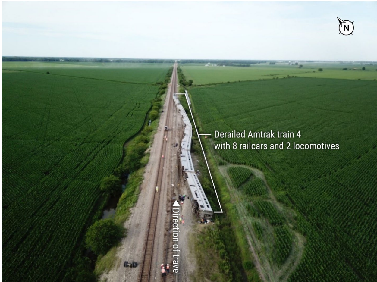
Figure 1. Amtrak train 4 after the collision.

The track near the collision was part of the BNSF Marceline Subdivision. It was Class 5 track as defined in federal regulations at Title 49 Code of Federal Regulations (CFR) 213.9, meaning that the maximum allowable operating speeds were 80 mph for freight trains and 90 mph for passenger trains. Train movements in the area were coordinated by a BNSF train dispatcher located at the BNSF Dispatch Center in Fort Worth, Texas. 2 The track along the Marceline Subdivision was signaled and equipped with a positive train control system that enforces signal indications. 3 The positive train control system was enabled and operating at the time of the collision.