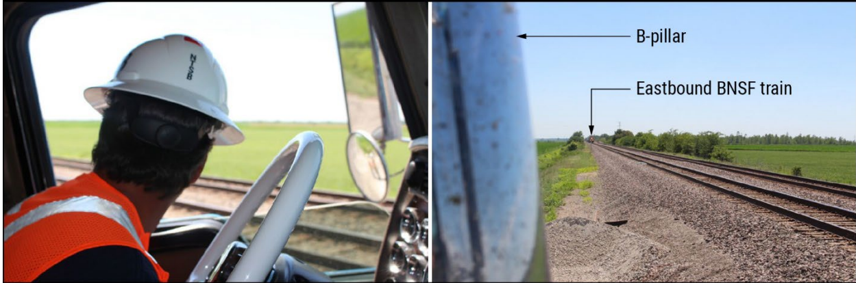
Figure 5. An NTSB investigator (left) leans forward to see an eastbound BNSF train (right).