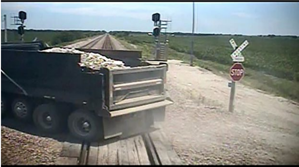
Figure 3. Truck in the crossing shortly before collision.

Based on the MSHP accident report provided to the NTSB, a witness called 911 and dispatchers notified emergency responders of the crash at 12:45 p.m. Emergency responders arrived on scene at 1:02 p.m. Two passengers from the train's lounge car and the truck driver were pronounced dead at the scene by the Chariton County coroner; a third passenger was pronounced dead at University of Missouri Hospital in Columbia, Missouri. The NTSB's investigation did not definitively identify which railcar the third deceased passenger was in before the collision and derailment. An additional 146 passengers and Amtrak crewmembers were transported to local hospitals for treatment.