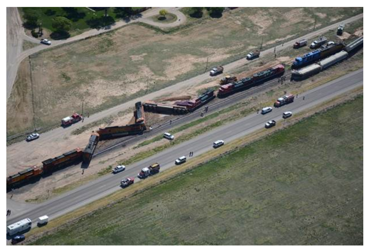
Figure 1. Accident site.

The crew of the standing train had secured their train on the Chisum siding and gone off duty at 6:00 a.m.; they were not in the area at the time of the accident. The conductor of the standing train later told a manager that he had failed to line the switch for normal main track movement at the Chisum siding.