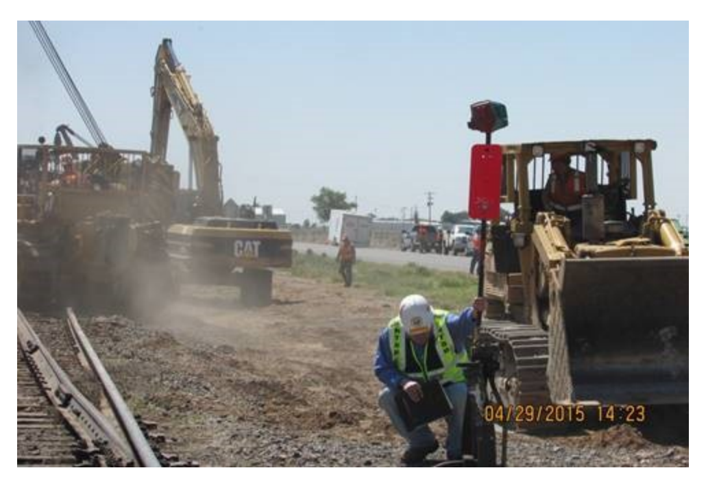
Figure 3. Investigator inspecting the switch stand and operating rod.