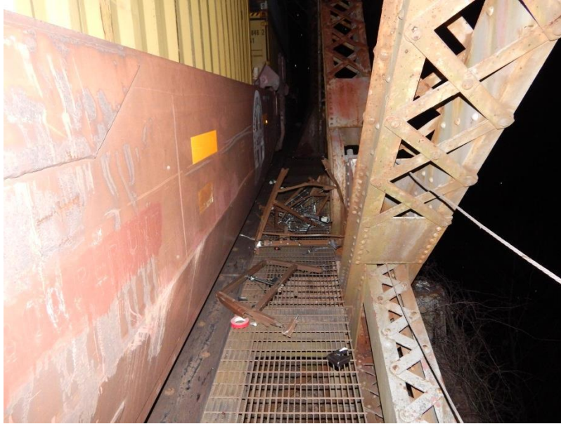
Figure 3. The walkway on east side of railroad trestle and remnants of the prop after being struck by the train.