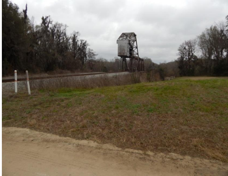
Figure 1. Railroad bridge over the Altamaha River.

In January 2014, about a month before the accident, the location manager for the film production company called CSX requesting permission to film on CSX property. 1 Within a week, CSX denied the request in an e-mail dated January 27, 2014, stating: