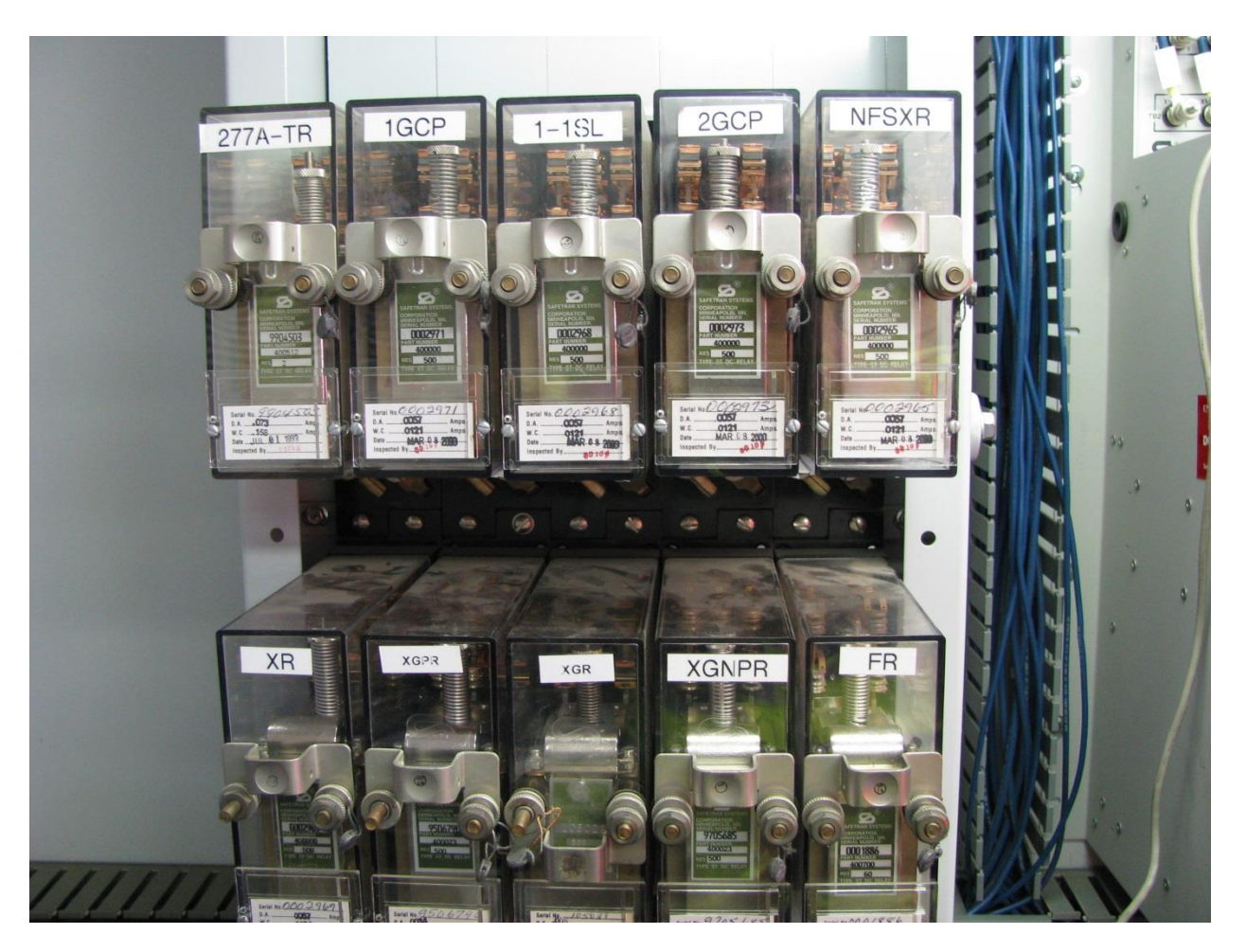
Figure 2. Relay rack in UP signal bungalow at Bissell Street crossing

NTSB investigators took custody of the GCP-3000 unit for UP main track 2 for testing by the manufacturer. The investigators specified the tests to be conducted and observed the testing at the manufacturer's facility. Examination of the 12 plug-in printed circuit modules<sup>16</sup> found no damage to the electronic components. The top retaining clips, used to lock the printed circuit modules in place within the chassis, were cracked on two of the modules of the main unit. Despite the cracked retaining clips, both modules were seated properly in the 43 pin connectors and operation of the unit was not affected.