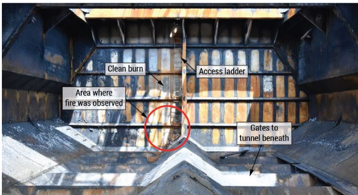
Figure 6. Photo of the fire damage to the forward bulkhead of cargo hold no. 2, showing the location circled in red where welder, fitter, and fire watch saw the initial fire.

During the postcasualty examination of the interior of the vessel, investigators identified a white residue in cargo hold no. 1 which was similar in appearance to pot ash, and a black residue in cargo hold no. 3 which was similar in appearance to nut coke. Samples were collected from the two residues and sent to a laboratory to identify the content and to determine if residues from previous cargos were present, however the material in the samples could not be identified.