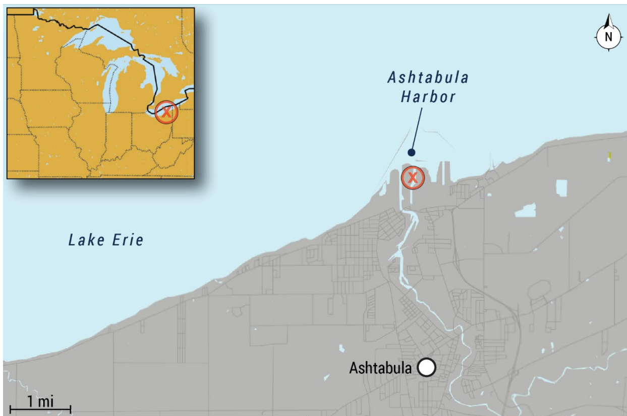
Figure 2. Area where the Cuyahoga caught fire, as indicated by a circled X.