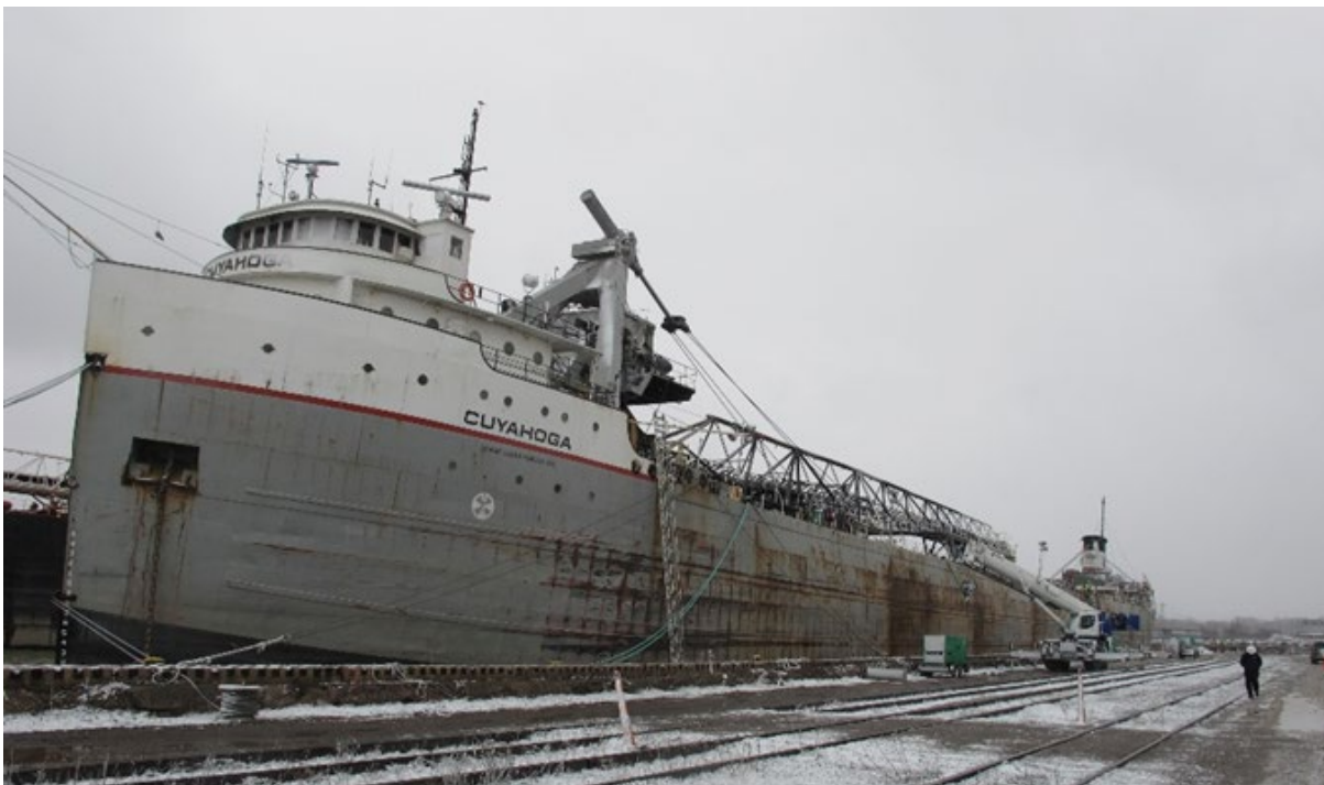
Figure 1. Cuyahoga after the fire, on March 20, 2024.

On March 15, 2024, about 1315 local time, the bulk carrier Cuyahoga was undergoing maintenance while docked in Ashtabula, Ohio, when a fire broke out in a cargo hold where hot work was being conducted (see figure 1 and figure 2). 1 The crew and maintenance personnel on the vessel were unable to extinguish the fire and evacuated to shore. The Ashtabula Fire Department, with assistance from the ship's crew, extinguished the fire. There were no injuries, and no pollution was reported. The vessel was declared a constructive total loss estimated at $11 million. 2