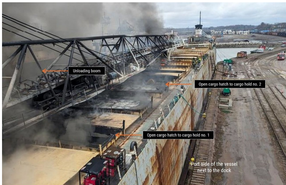
Figure 5. Cuyahoga during the fire.

About 1320, the Ashtabula Fire Department received several notifications of the vessel fire from bystanders. Fire trucks arrived at the vessel about 1330, and firefighters were informed that everyone on board had been evacuated. Firefighters used three engine trucks and a ladder truck to apply water to initially fight the fire on the main deck from the dock. As the firefighting efforts continued, the firefighters worked with the vessel's crew to ensure that the amount of water added to the vessel to extinguish the fire did not affect its stability. Firefighters then boarded the vessel to apply water and foam directly into the cargo holds that were on fire. The fire was declared extinguished about 2200, and firefighters then monitored the area of the fire to prevent reignition.