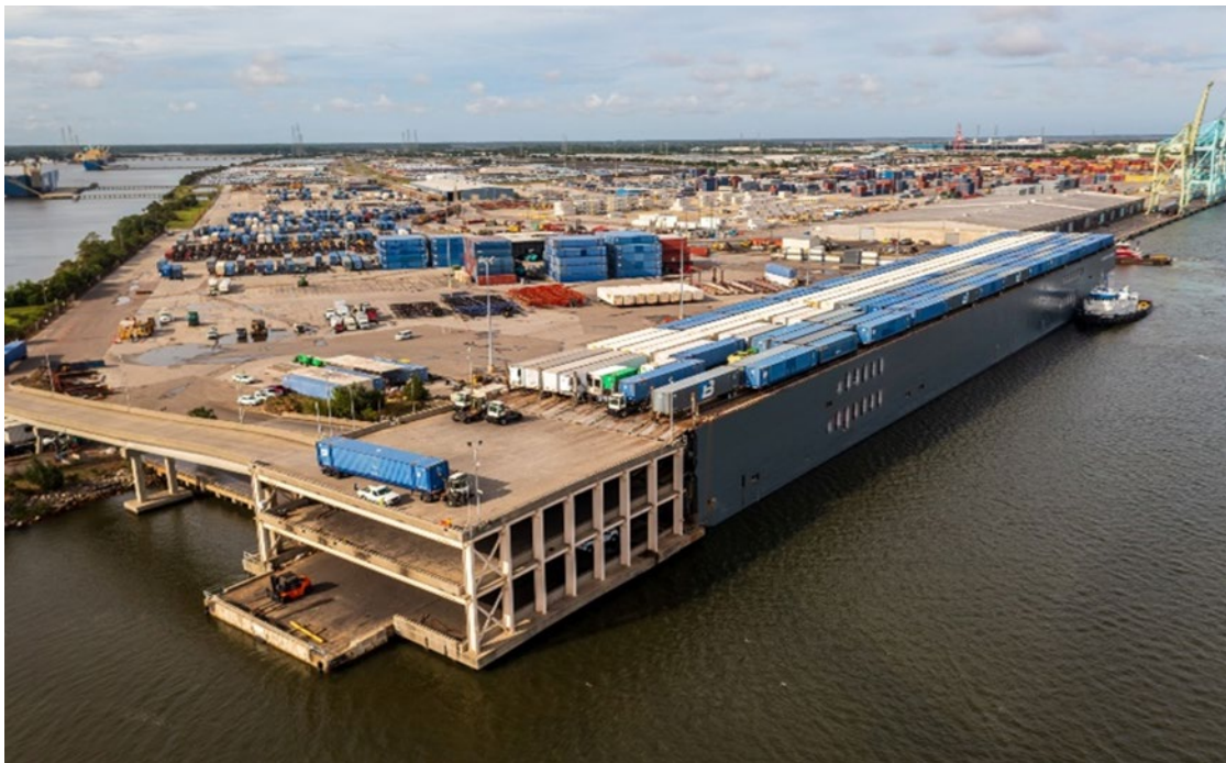
Figure 1. Barge San Juan-JAX Bridge moored in Jacksonville, Florida, on unknown date before the casualty.

On June 8, 2023, about 2130 local time, the freight barge San Juan-JAX Bridge contacted the Army Terminal Pier in Cataño, Puerto Rico, while being moored by the ocean tug Signet Thunder and three assist tugs (see figure 1 and figure 2). 1 There were no injuries, and no pollution was reported. Damage to the barge was repaired at a cost of $277,571.