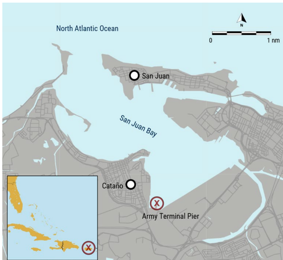
Figure 2. Area where the San Juan-JAX Bridge contact occurred, as indicated by a circled X.