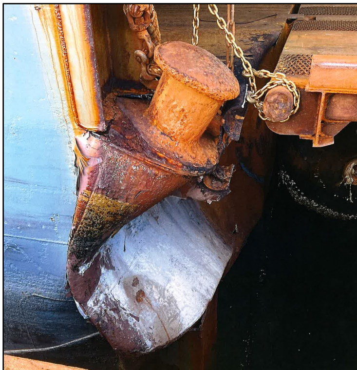
Figure 4. San Juan-JAX Bridge's damaged port quarter.

The San Juan-JAX Bridge suffered fractured frames and a 3-meter-by-4-meter buckled area of the transom and main deck (see figure 4). The transom and bottom plating were also holed. Repairs were made to the barge at Grand Bahama Shipyard, and the vessel returned to service that month, in June 2023.