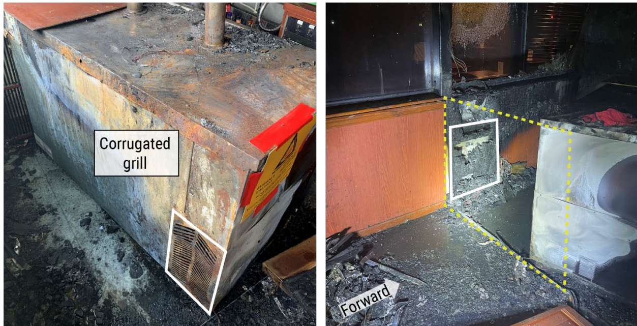
Figure 4. (Left to right) Origin area of the fire on corrugated grill (outlined) on main deck bar refrigeration unit, with fire pattern mirrored (outlined) on portside bulkhead. The area of a cabinet end panel in place prior to the fire is indicated by a dashed line.

The investigator determined that all other fire patterns originated from the grill fire pattern and propagated up toward the windowsill and overhead. The fire investigator concluded that the fire was accidental in nature and the cause may have been the refrigeration unit's motor (the hermetically sealed compressor) overheating due to improper ventilation, which led to the combustion of flammable materials in the area.