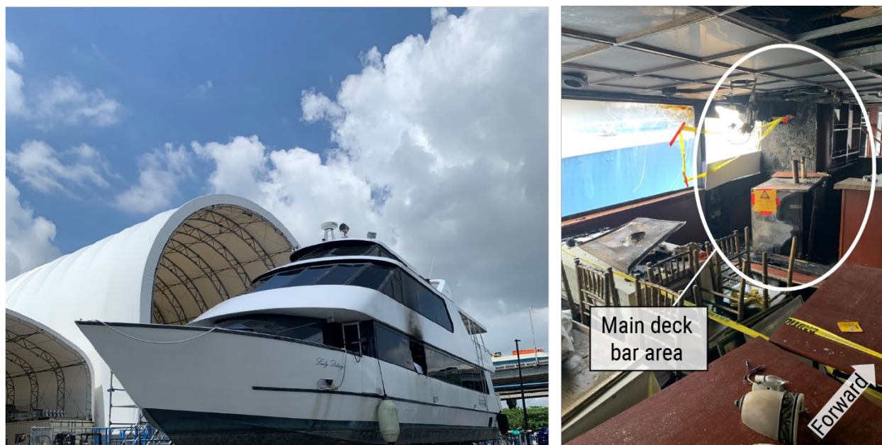
Figure 3. (Left to right) Lady Delray after the fire, with fire-damaged portside window and portside main deck bar area.