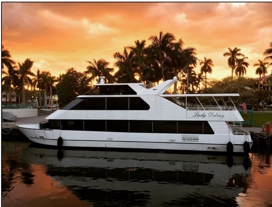
Figure 1. Lady Delray docked before the fire.

On April 12, 2023, about 0015 local time, the small passenger vessel Lady Delray was moored, unattended and locked up, alongside the dock at Veterans Park on the Intracoastal Waterway in Delray Beach, Florida, when a bystander on shore reported a fire on board the vessel. 1 The local fire department responded to the scene and extinguished the fire. The vessel was later towed to a boatyard for repairs. No pollution or injuries were reported. Damage to the vessel was estimated at $500,000.