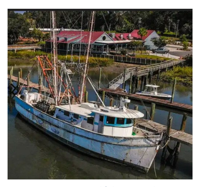
Figure 3. Commercial fishing vessel Having Faith precasualty.

On the morning of March 16, the captain of the Carol Jean began preparations to tow the Having Faith from Port Royal to Valona, with the assistance of a friend. The captain found a 100- to 150-foot-long rope in a forward