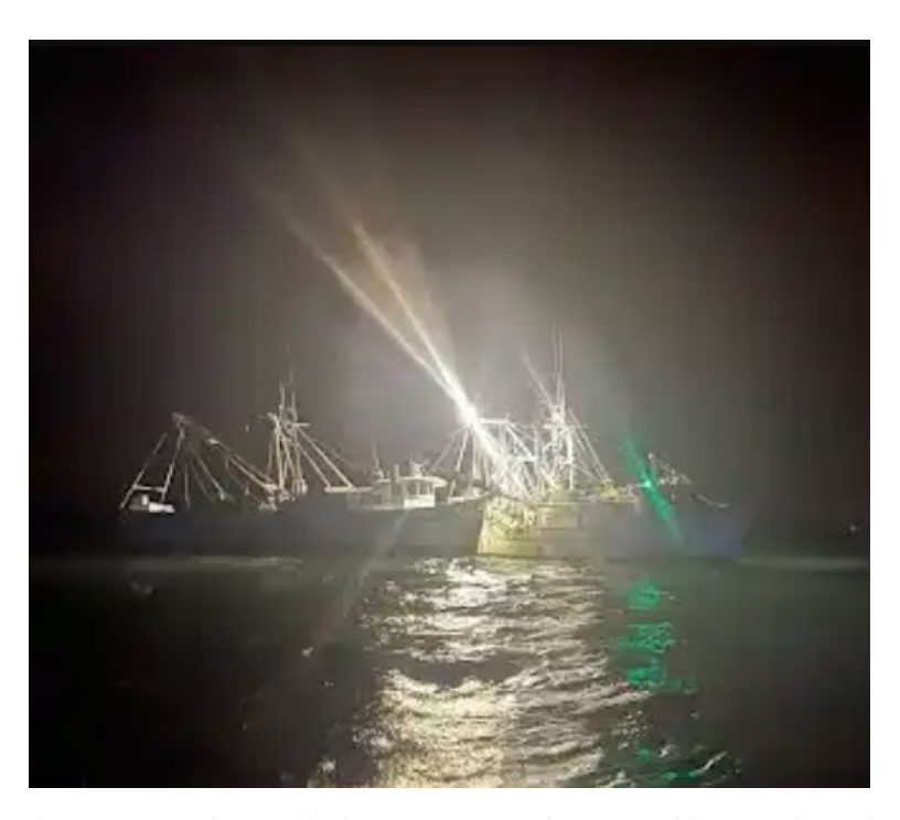
Figure 4. The Carol Jean at anchor with the Having Faith secured by tow line about 2245 on March 16.

Weather forecasts for the evening of March 16 indicated winds 5 to 10 knots, with seas from 1 to 2 feet. The captain stated that, although he attempted to keep the Having Faith secured to the Carol Jean , he could not, and it "ended up floating away." Throughout the night and into the early morning hours of March 17, the Carol Jean dragged anchor; according to the vessel's automatic identification system (AIS) data, at 0713, the Carol Jean was about 7.5 miles northwest of where it had originally anchored.