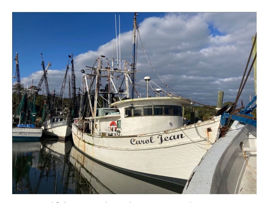
Figure 1. Commercial fishing vessel Carol Jean precasualty.

On March 21, 2023, while anchored with no one on board, the commercial fishing vessel Carol Jean flooded and sank in the Atlantic Ocean near Tybee Island, Georgia.<sup>1</sup> After the vessel's emergency position indicating radio beacon activated at 1903, the US Coast Guard responded and found a debris field where the beacon's signal originated. There was no pollution reported. The loss of the Carol Jean was estimated at $250,000.