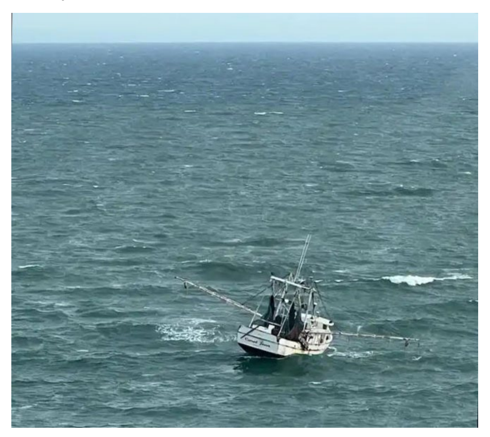
Figure 5. Aerial view of the Carol Jean from the responding Coast Guard helicopter on March 17 before the captain and his friend were rescued.

on March 17. At 1818, the Coast Guard transported the captain and his friend to a local hospital, where they were evaluated and released.