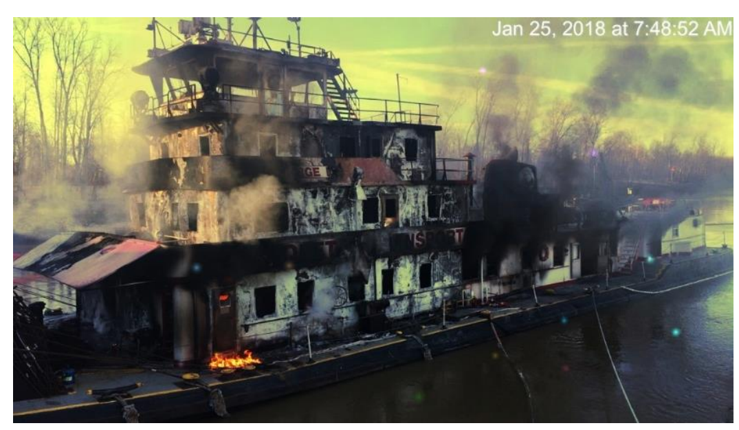
George King still burning about 0749 on the day after the fire started.

The George King was extensively damaged by the fire, but the main structure of the vessel and the main propulsion system remained intact. The fire, as witnessed by the chief engineer and other crewmembers, was initially located on top of the forward section of the port main propulsion engine.