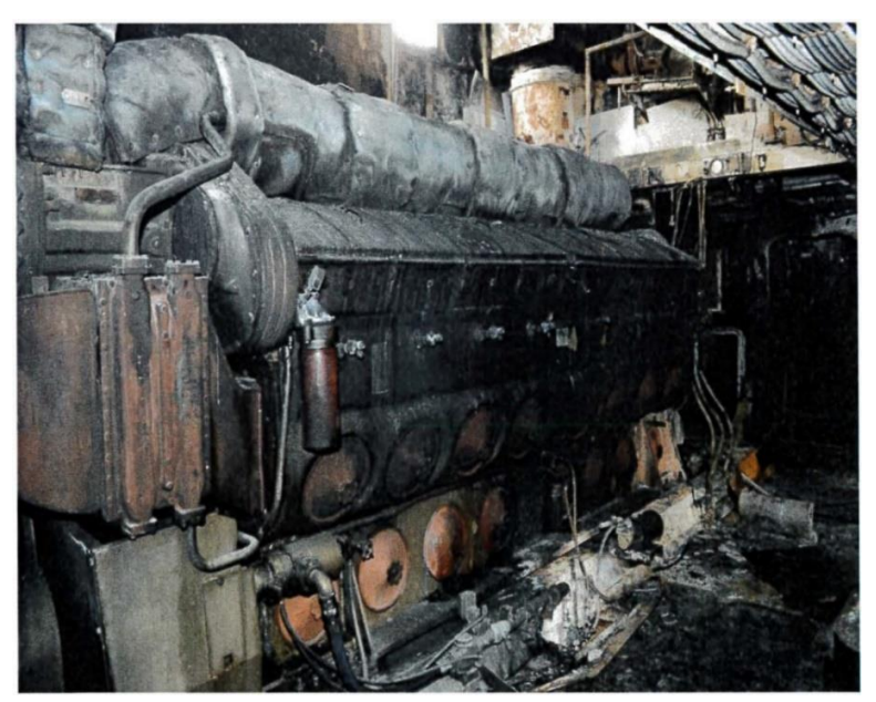
Port main propulsion engine, looking forward.

Because the lube oil system was a pressurized system, a small leak in the strainer's housing or at the covers for the strainers could have caused escaping oil to atomize. Atomized oil is susceptible to ignition and flashover if there is a viable heat source located nearby, and there were a number of hot surfaces within the George King 's engine room. It is likely that atomized lube oil spraying from the port strainer was ignited after making contact with a hot surface near the strainer housing, which progressed into a continuous burning fire after an initial flashover. This scenario coincides with the statements of the captain, which identified a flash followed by flames coming from the engine room exhaust vents on the port stack.