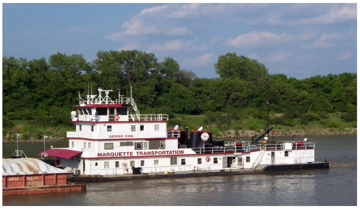
George King under way prior to the fire.

About 2041 local time on January 24, 2018, the towing vessel George King was pushing 30 empty barges upbound on the Lower Mississippi River at mile 393.6 when a fire began in the engine room and quickly spread. The crew abandoned the vessel after unsuccessfully trying to extinguish the fire. No pollution or injuries were reported. The estimated property damage exceeded $500,000.