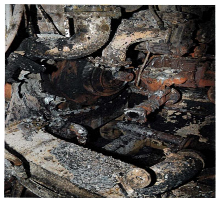
Remains of the port lube oil strainer.

Because the lube oil system was a pressurized system, a small leak in the strainer's housing or at the covers for the strainers could have caused escaping oil to atomize. Atomized oil is susceptible to ignition and flashover if there is a viable heat source located nearby, and there were a number of hot surfaces within the George King 's engine room. It is likely that atomized lube oil spraying from the port strainer was ignited after making contact with a hot surface near the strainer housing, which progressed into a continuous burning fire after an initial flashover. This scenario coincides with the statements of the captain, which identified a flash followed by flames coming from the engine room exhaust vents on the port stack.