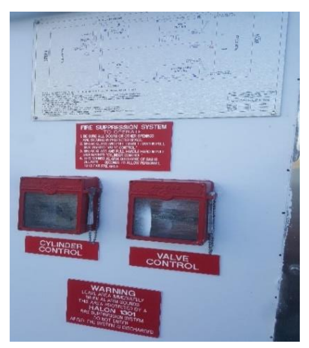
Halon activation station

The George King's electrically driven fire pump stopped when the generator shut down, and thus the fire hoses lost water pressure. Therefore, the captain directed that the vessel's halon fixed firefighting system be activated to extinguish the fire. The chief engineer tried to reach the port halon activation station located on the aft section of the house. This required him to walk past the engine room doors. However, the flames erupting from the broken engine room windows and open double doors prevented him from proceeding down the port side of the vessel.