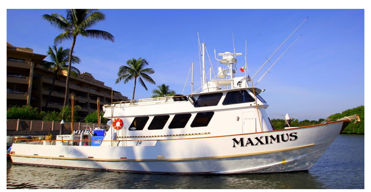
Maximus in Cabo San Lucas, Mexico, before the accident.

On the evening of May 12, 2016, the Maximus , a 42-gross-ton small passenger vessel, began taking on water while under way near Turtle Bay, Mexico. The four crewmembers could not stop the flooding and abandoned ship into a liferaft, from which a good Samaritan vessel rescued them. No injuries or pollution were reported. The Maximus was valued at $575,000.