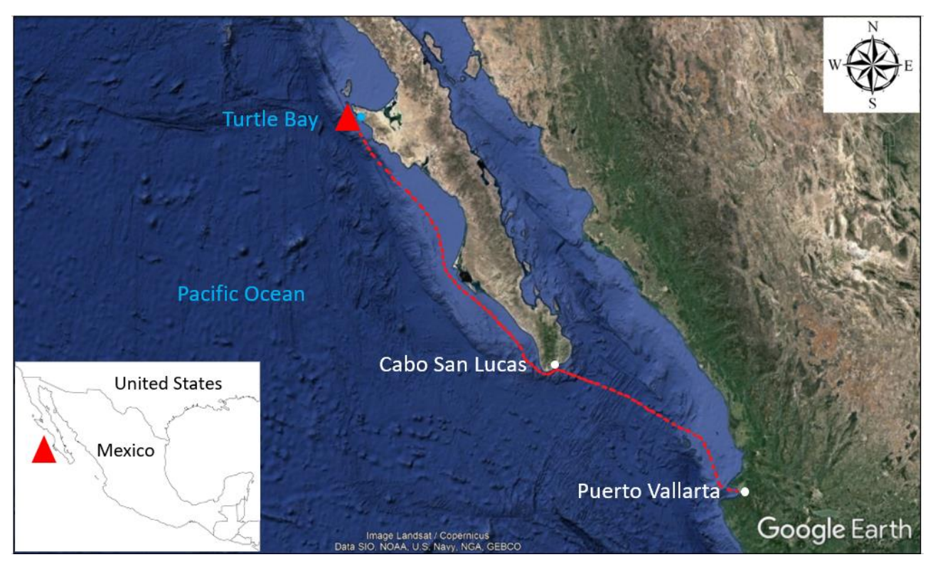
Overlaid symbols on an excerpt from Google Earth Pro depict the Maximus trackline and sinking location near Turtle Bay, Mexico.

The Maximus was built in 1984 by Oxnard boatyard in Channel Islands Harbor, Oxnard, California, and successfully completed a US Coast Guard-supervised simplified stability test that same year for the carriage of 49 passengers on exposed waters. The vessel was owned and operated by Maximus Sportfishing Inc. during its final 6 years and served as a chartered sportfishing vessel with two schedules, summer and winter (October through April). During the summer, the Maximus made offshore fishing trips out of San Diego, California. In the winter, the vessel worked out of Puerto Vallarta, Mexico. The captain had 32 years of experience in the fishing industry; for the last 15 years, he had been credentialed as master of 100-gross-ton vessels.