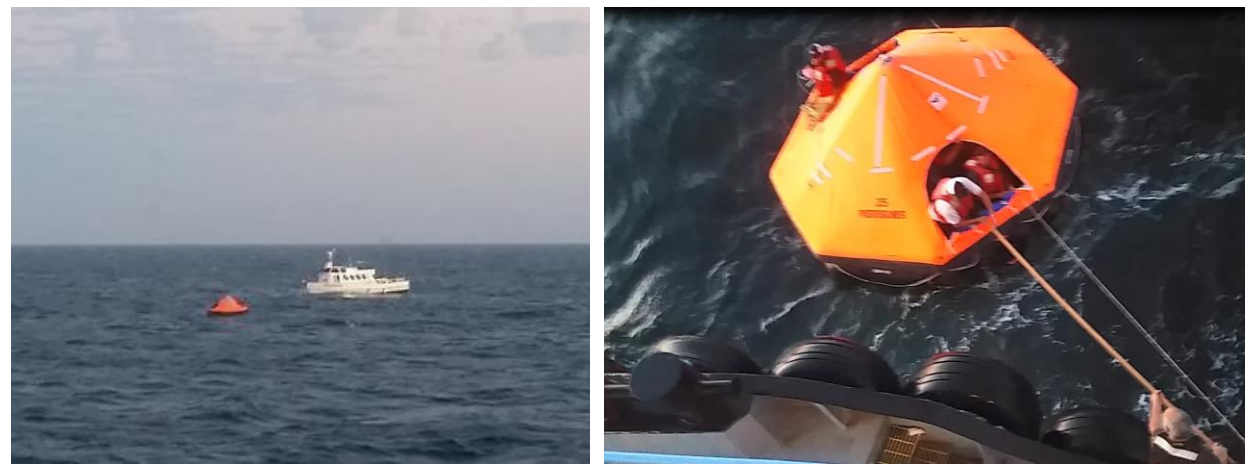
At left, Maximus and its liferaft. At right, the Maximus crewmembers about to be brought aboard Shannon Dann .

At 1959, helicopter 6501 departed the scene after confirming that the Maximus crewmembers were safely on board the Shannon Dann . As the helicopter departed, the flight crew observed the Maximus floating high in the water with a slight starboard list and trim by the bow, its navigation lights energized. The last recorded position of the vessel was 27°29.5'N, 114°50.1'W.