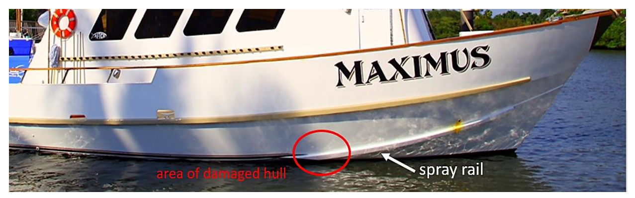
Maximus in Cabo San Lucas before the accident. A red circle indicates the reported area of hull damage.

For more than an hour and a half, the Maximus captain and crew continued to dewater the vessel without success. The captain determined that the flooding could not be slowed based on the hole in the hull and the limited capacity of the bilge pump, and that he and the crew should abandon ship. He instructed the mate to distribute lifejackets to the crew, and they all went to the top deck to manually launch the liferaft that was stowed there. The captain removed the hydrostatic release unit and lashing. The crew attached an additional 45 feet of line to the painter and threw the liferaft canister from the top deck into the water. The liferaft inflated and was tied off on the leeward side of the vessel while the crewmembers began collecting their personal items. Then the captain activated the emergency position-indicating radio beacon (EPIRB).<sup>2</sup>