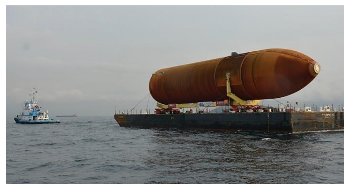
Towing vessel Shannon Dann with space shuttle Endeavour 's external fuel tank (ET-94) under tow.

About 1850, as the sun was setting, the four Maximus crewmembers safely entered the liferaft and drifted away from the sinking vessel. At 1856, Coast Guard helicopter 6501, which was aboard the Coast Guard cutter Active about 35 miles away, launched with a dewatering pump on board to assist the Maximus crew.