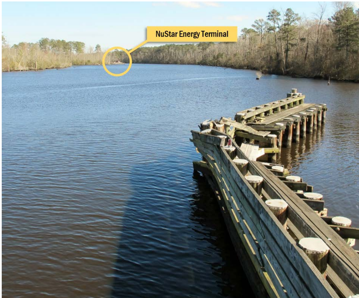
Damage to the southside fender of the North Landing Bridge.