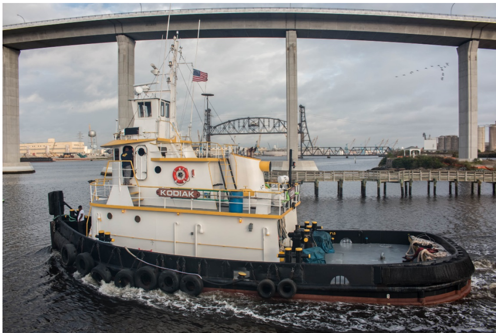
Tugboat Kodiak under way.

On March 1, 2016, about 0322 local time, the open barge SJ-199 being pushed by the tugboat Kodiak allided with the North Landing Bridge at mile marker (mm) 20.2 in Chesapeake, Virginia. Just before the allision, the tow had run over a mooring dolphin located on the north side of the river 750 yards from the bridge. Although the vessel incurred no damage, the barge and the bridge sustained an estimated total of $275,000 in damage. No pollution or injuries were reported.