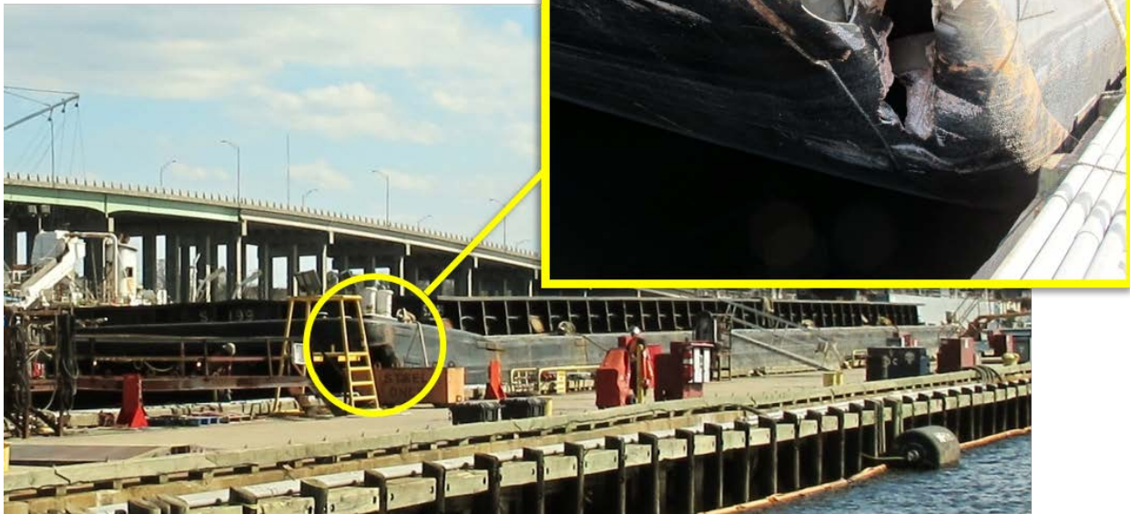
Barge SJ-199 docked at the repair yard.

Feeling the contact from the allision, the captain awoke and came to the bridge to assess the damage. He told investigators that he heard the mate talking to the bridge tender via radio, recalling, “Said he [the mate] hit something on bottom and had to realign barge to come through bridge.” The mate told the captain that he thought he struck an underwater object. Because it was dark, the mate did not notice any damage to the fender system and therefore did not bother using the Kodiak ’s searchlight to look for damage. Also, because the damage was below the main deck, the deckhand on the bow and the bridge tender could not see the penetration at the corner of the rake on the port side of the SJ-199 .