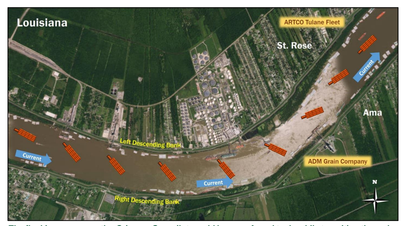
The flanking maneuver the Crimson Gem pilot would have preferred to do while transiting through the bend to mitigate the risk of the swift current. Vessel proportion is for illustration only. (Background by National Geographic MapMaker Interactive)

The pilot would have preferred to have "flanked" the bend, as he told investigators. Flanking allows tows to pivot around the point of a bend, similar to how a large log might drift downriver. A vessel operator may decide to flank around a bend if the combined forward speed of the vessel and the current might otherwise push the tow onto the outside riverbank before the turn can be completed. Compared with steering around a bend, flanking requires more time to navigate