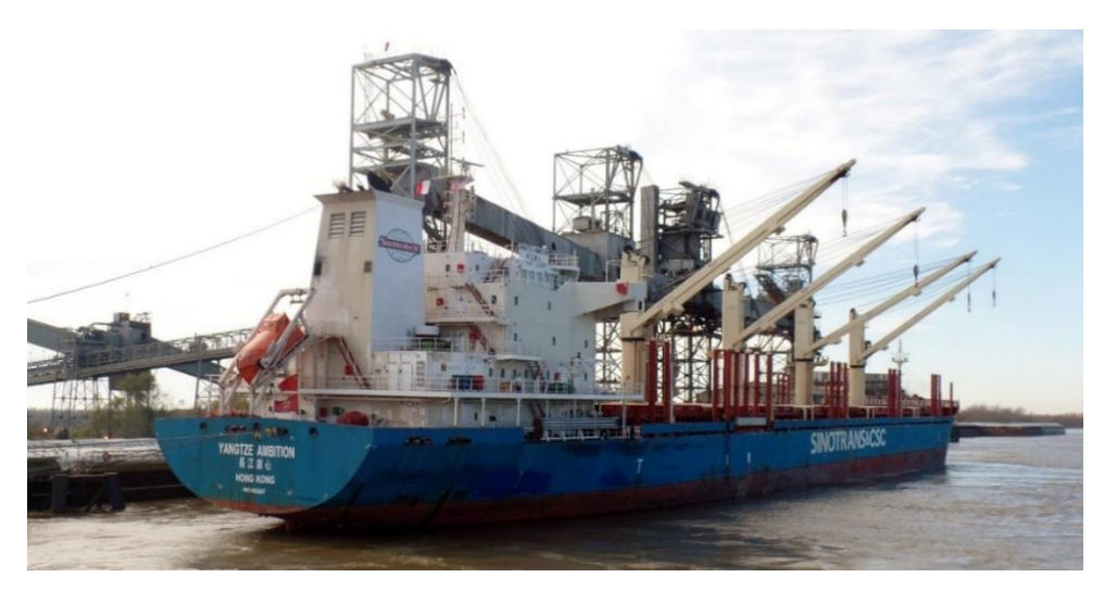
Bulk carrier Yangtze Ambition.

Less than one-half mile before the Crimson Gem 's destination, the Yangtze Ambition was docked on the opposite bank at the Archer Daniels Midland (ADM) Grain Company facility at mm 117.6, in Ama, Louisiana, near the bottom of a 67-degree bend in the river.