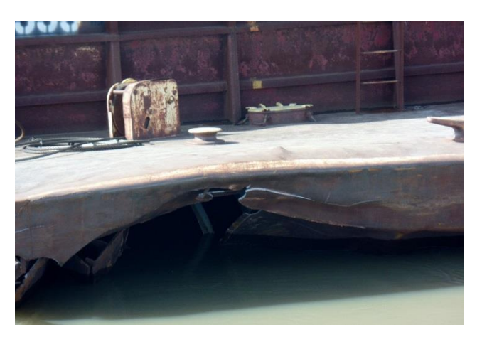
Damaged starboard bow of barge XL 359 from the Crimson Gem tow.

The Crimson Gem pilot held a Merchant Marine Credential as Master of Towing Vessels on the Western Rivers since 2005. He had been on board the Crimson Gem for one year and had operated line-haul tows on the Lower Mississippi River for 16 years.