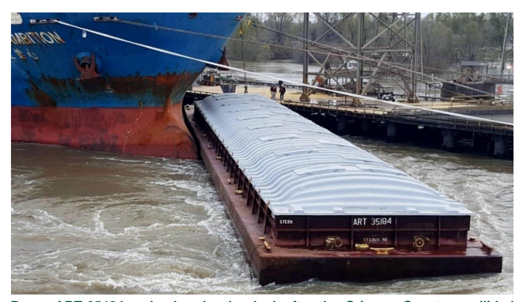
Barge ART 35184 wedged under the dock after the Crimson Gem tow collided with the bulk carrier Yangtze Ambition.

The Yangtze Ambition sustained a 12-inch-by-16-inch hole on the port side of the bulbous bow, costing an estimated $25,000 to repair. On the barges, steel plates had to be replaced on the bows of the lead barges ART 35184 and XL 359 for an estimated $150,000 each and on the stern of the aft barge RRS 7946 for an estimated $100,000.