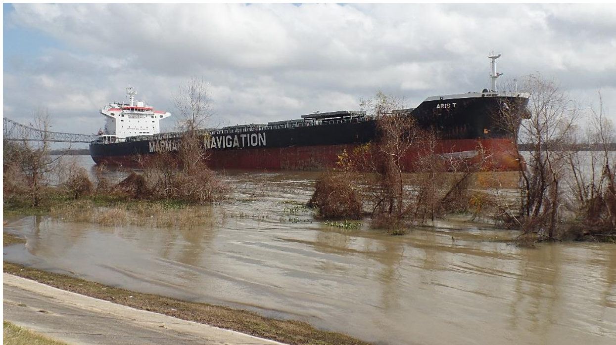
Postaccident image of the Aris T anchored on the Mississippi River at Grand View Reach Anchorage, mm 147.0, near Gramercy, Louisiana.

On January 31, 2016, at 1953 local time, bulk carrier Aris T collided with tank barge WTC 3019 , towing vessel Pedernales , and two facility structures, all of which were located on the left descending bank of the Mississippi River between mile marker (mm) 125.2 and mm 126.0 at Norco, Louisiana. Also damaged during the collision were one additional shoreside structure, another towing vessel, and two other tank barges, bringing the total damage cost to more than $60 million. No pollution resulted from the accident; however, two dock workers reported injuries.