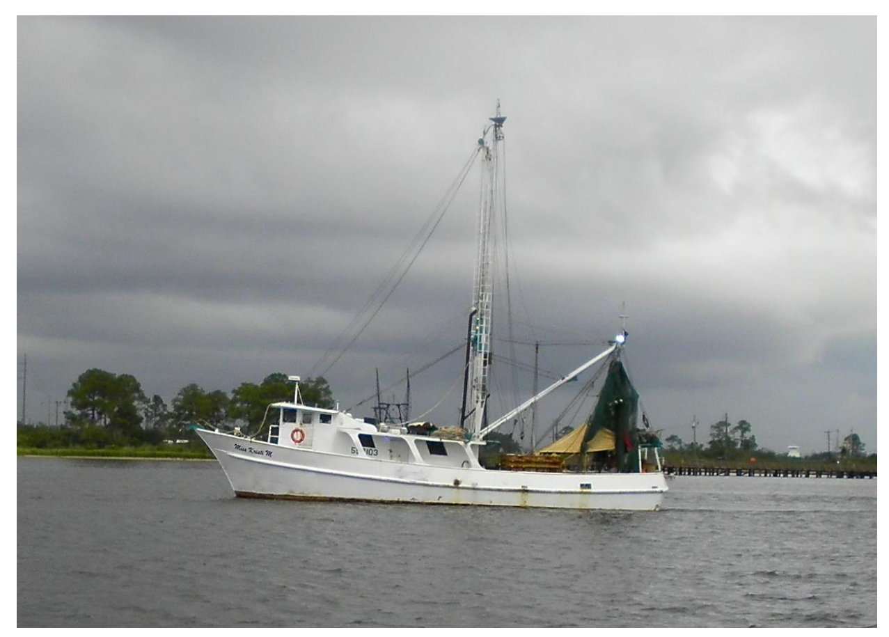
Image of Hawaii Five-1 before the conversion, when the vessel was known as Miss Kristi M.

In early November, the conversion work was completed and the vessel departed South Marine Systems shipyard for sea trials, which were limited in scope and performed in calm waters on the Pascagoula River and Pascagoula Sound. The captain and the owner who had overseen the conversion had no concerns with the vessel's stability or seakeeping resulting from the sea trials. However, only the vessel's initial stability—its resistance to small changes in the forces acting on it—was observed, and this only "by feel" with the vessel heeling very little.