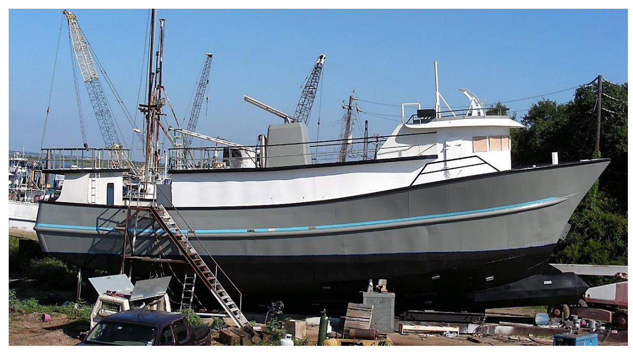
Side profile of Hawaii Five-1 taken after the conversion at the shipyard located in Pascagoula, Mississippi.

On November 25, 2015, at 1158, the uninspected fishing vessel Hawaii Five-1 , en route to Honolulu, Hawaii, from Bayou La Batre, Alabama, capsized and subsequently sank in the Gulf of Mexico just north of the Straits of Yucatan. The two crewmembers, a captain and a deckhand, managed to board a liferaft and were rescued by the Coast Guard later that night. The crew reported minor injuries associated with the accident.