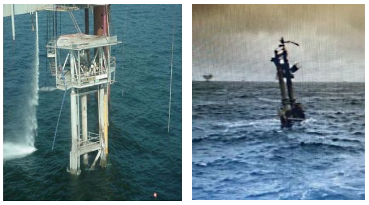
The left photo shows the unmanned platform South Timbalier 271A before the accident, and the right photo shows the remains of the platform after the allision and fire.

The captain (who was asleep in his cabin) arrived on the bridge less than 1 minute after the allision, took over the conn, and called the Coast Guard. All of the crew and additional personnel were accounted for. After the gas and pipelines were shut down, three nearby good Samaritan vessels approached the platform and applied water until the fire was extinguished. The crew of the Connor Bordelon quickly assessed the state of the vessel and found that it was taking on water forward where the hull was penetrated below the waterline after striking the platform. The captain notified the Coast Guard of the situation, and the Coast Guard released the vessel from the scene so that it could travel back to Port Fourchon (about 5 miles away), where the flooding and damage would be further assessed.