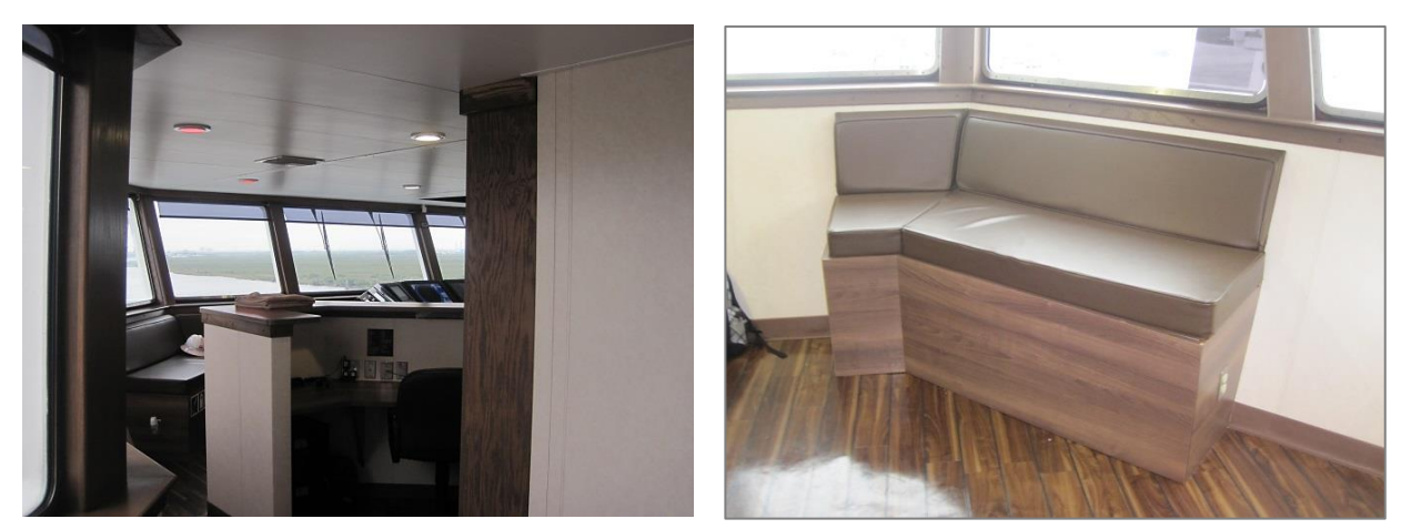
The left photo shows the captain's office on the port side of bridge, where the OS was located just before the allision. The right photo shows the settee on the starboard side of the bridge, where a mate was resting just before the allision.

The bridge team on the accident watch consisted of the two mates, an able-bodied (AB) unlicensed sailor qualified to perform routine duties aboard the vessel, and an ordinary seaman (OS) who had less experience than the AB. The AB and the OS performed various duties as directed by the mates, including safety checks of the vessel and, when instructed, lookout duties. The two mates switched out the conn as they deemed appropriate. The mate on watch at the time of the accident took over the conn about 0340, about 50 minutes before the accident. The mate he relieved then went to rest but remained awake on a settee (small couch) located on the starboard side of the bridge below the bridge windows. At that time, the AB was below deck in the galley (with permission from the mate on watch). The OS was on the port side of the bridge in the captain's office, which had a small desk with a privacy wall that would not have allowed a view forward out the windows if he was seated at the desk. According to the AB and the OS, the mate on the settee could perform the lookout duties when called to do so. However, the mate on watch did not ensure that a designated lookout was on the bridge.