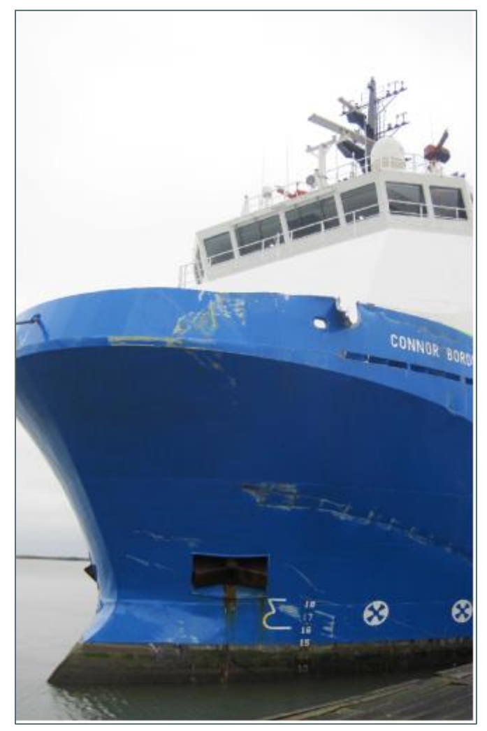
The damage to the Connor Bordelon resulting from its allision with the unmanned platform. The damage included hull scrape marks and a ripped bulwark near the vessel's name. The vessel also sustained damage below the waterline resulting in flooding.

The Connor Bordelon was newly constructed in 2013. The navigation bridge had a state-of-the-art integrated bridge system with all of the controls and monitors within arm's reach of the conning chair. The mate on watch, who was 60 years old at the time of the accident and had a medical waiver on his license for glasses, had been working on this vessel for more than 1 year but stated that he felt challenged by the automated equipment. He also stated that he was "old school" and that "all this technology is not my cup of tea." The conning station center console had an emergency transfer button directly below the autopilot's touch screen. This button would have immediately reverted all automation (engine and steering) to manual control and allowed the mate to manipulate the steering more quickly to maneuver the vessel away from the platform. The mate remarked that he did not know about the emergency transfer button, but the captain stated that the mate was familiar with the emergency button.