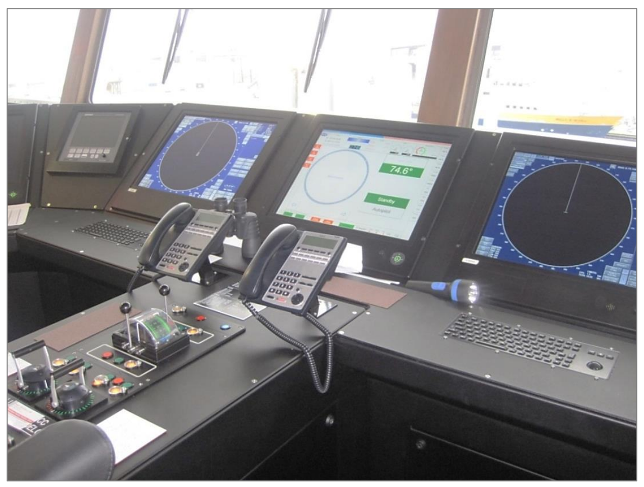
Conning station, where the mate on watch was located. The autopilot is located in the center, and radars are located on both sides of the autopilot. Manual controls are located on the center console.

The mate on watch stated that he was using the autopilot to operate the vessel. He had adjusted the heading from 011 to 017 degrees to account for the northeast winds, which were setting to the west, and to aim for the "hole in the wall," an area in the Gulf of Mexico with wide separation between the charted platforms. He was independently controlling propulsion engine rpm and was maintaining a speed of about 8 knots.