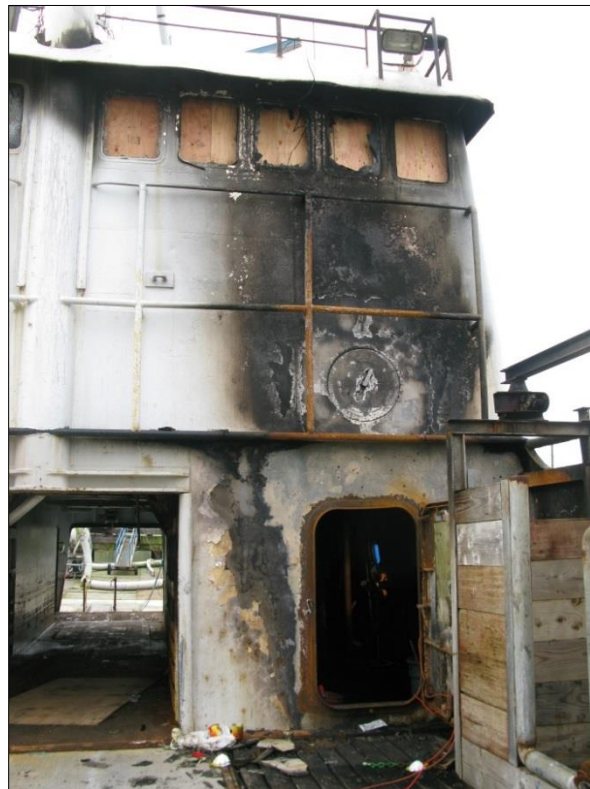
Fire damage to exterior of house on port side.

The vessel sustained major fire damage to the house on the main deck, the second deck, and the bridge. The only portion of the house not affected was the starboard side main deck, which was separated from the fire by the trawl tunnel.