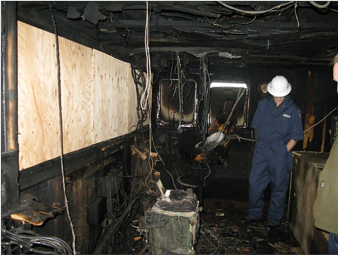
A Coast Guard investigator stands in the charred remains of the bridge, starboard side.