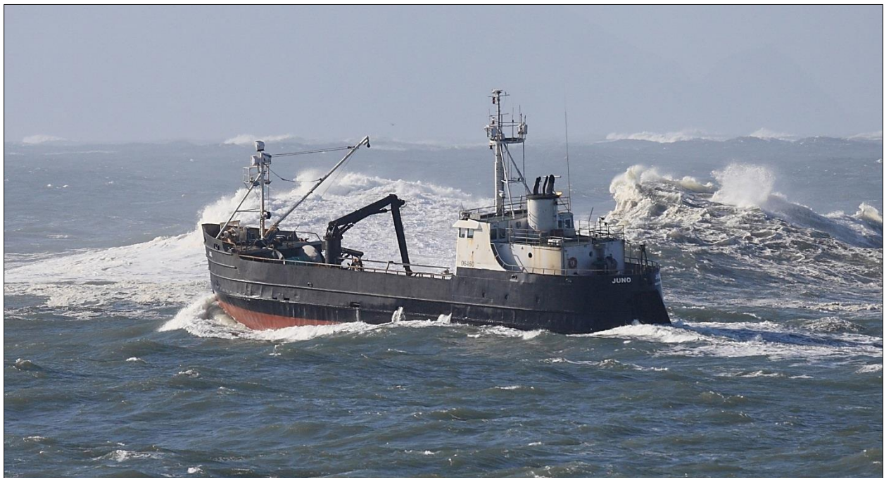
Fish processing vessel Juno under way.

In the early morning hours on Saturday, December 28, 2013, the 138-foot-long fish processing vessel Juno caught fire while moored at its pier in Westport, Washington. Shoreside firefighters extinguished the blaze, which caused extensive damage. The master received minor injuries, and no pollution was reported as a result of the fire.