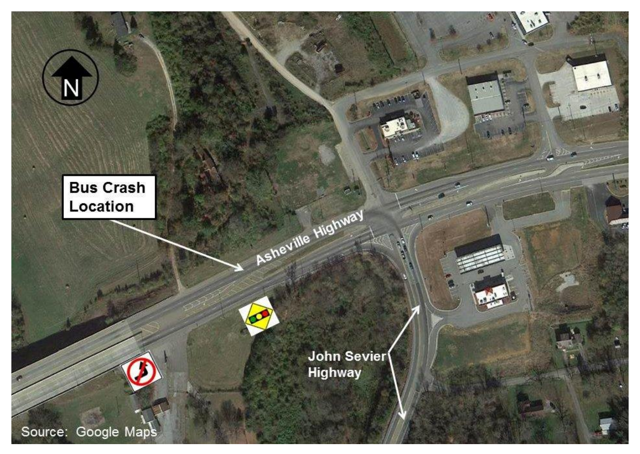
Figure 4. Locations of the advance "no left turn" and "signal ahead" signs on eastbound Asheville Highway, approaching the intersection with John Sevier Highway from the west (precrash route of eastbound bus #44).