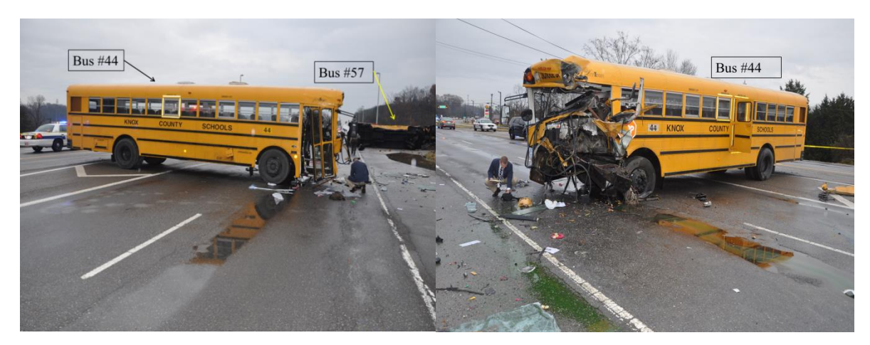
Figure 5. At left, bus #44 in final rest position, showing the right side of the bus (overturned bus #57 can be seen in the photo background). At right, the focus is on damage to the left front of bus #44. [Note: In both photos, the bright yellow tape used on the bus exterior to highlight emergency exits is visible.]

loading door were crushed in about 3 inches at the bottom. No significant damage was noted on the right (passenger) side or the back of the bus. (See figure 5.)