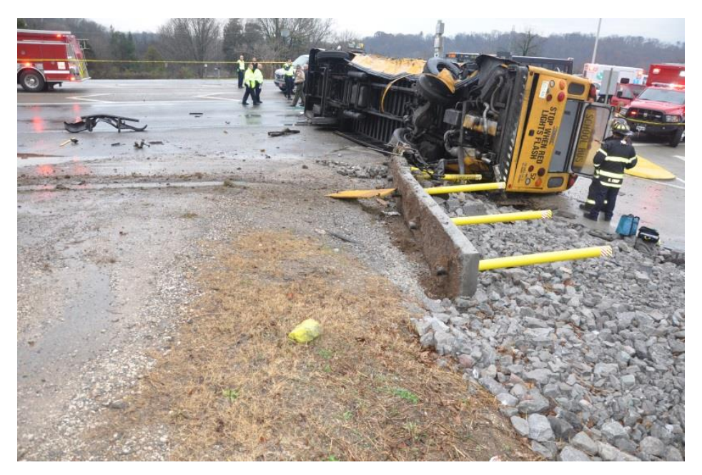
Figure 3. Bus #57 at final rest on its right side and the overturned barricade.

The most recent resurfacing on Asheville Highway in the vicinity of the crash occurred on March 11, 2005. At the request of the NTSB, the Tennessee Department of Transportation Materials Division conducted pavement friction testing on Asheville Highway in the crash area.