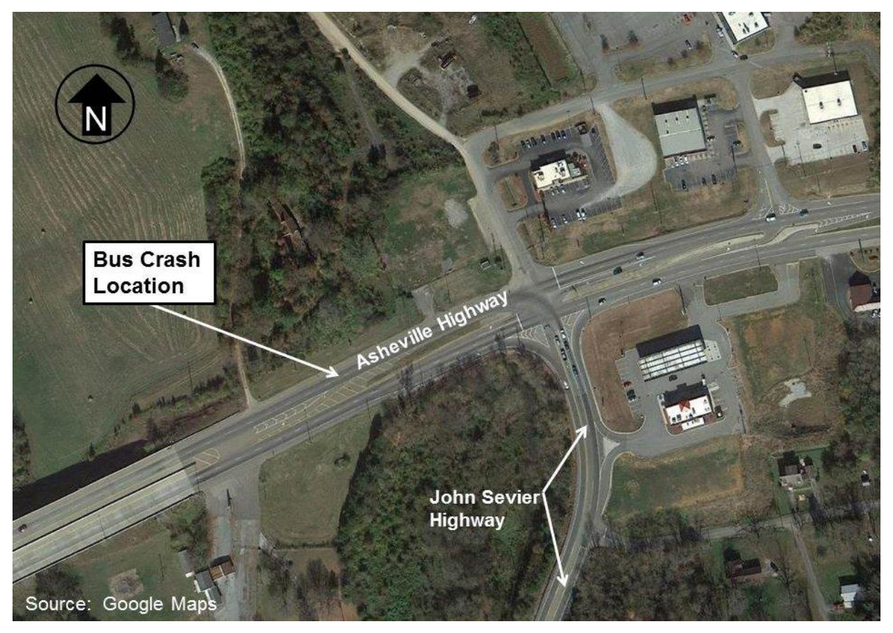
Figure 1. Crash location on westbound Asheville Highway, west of intersection with John Sevier Highway.

The National Transportation Safety Board (NTSB) initiated a field investigation of this crash with an emphasis on the human performance issues related to distracted vehicle operation. Highway and vehicle factors were also examined. This investigation was conducted with the assistance of the Knoxville Police Department (KPD).