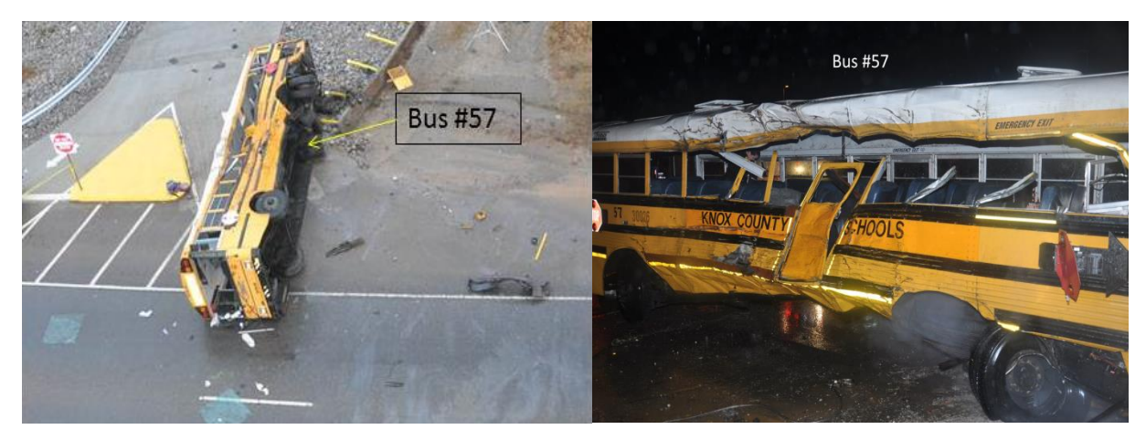
Figure 6. At left, bus #57 at final rest on its side. At right, view of bus #57 after it had been returned to an upright position, showing impact damage along the left (driver) side.

Significant damage, consisting of scrapes and dents, began at the left front wheel well and extended along the entire left side. The left sidewall was deformed inward; the deformation was most severe near the midpoint of the bus. The approximate intrusion distances into the passenger compartment measured 23 inches at the top of the windows, 15 inches along the lower portion of the window line, and 5 inches at the floor level. The panel at the bottom of the bus body had been pushed inward about 22 inches. There was a large tear in the left sidewall, beginning vertically at the level of the top of the wheel well and horizontally 78 inches aft of the front wheel well. (See figure 6.)