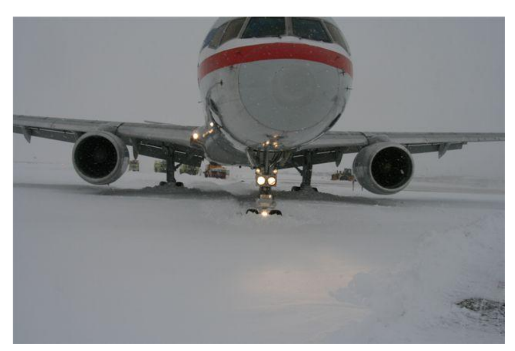
Figure 2. A photograph of the front of the incident airplane where it came to a stop in the snow off the departure end of runway 19 at JAC.