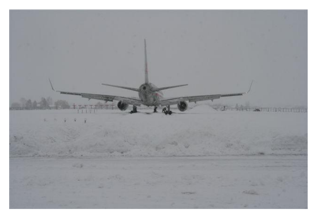
Figure 1. A photograph of the incident airplane, viewed from behind, where it came to a stop in the snow off the departure end of runway 19 at JAC.

When the airplane was stopped in the snow, the captain told the flight attendants not to evacuate immediately; he checked on the condition of the passengers and the airplane and determined that it was safer to remain in the airplane until help arrived. In the meantime, the first officer advised JAC air traffic control and American Airlines operations personnel that they had run off the end of the runway and would need assistance. All occupants remained on board the airplane until JAC ground personnel reached the airplane to assist in the occupants' egress. Postincident examination of the airplane revealed minor damage to the airplane. Figures 1 and 2 show the incident airplane where it came to a stop in the snow off the departure end of runway 19 at JAC.