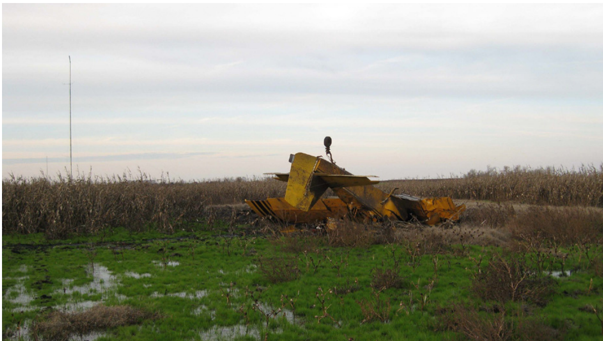
Figure 2. Photograph of N4977X wreckage and MET in the background.